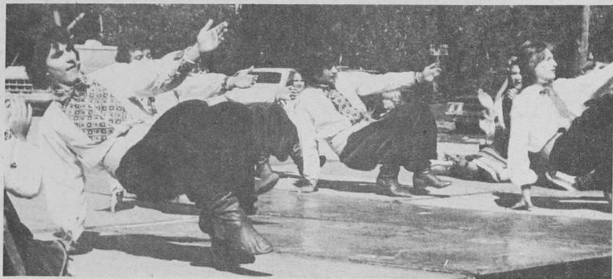
The Ukrainian Dance Troupe thrilled audiences all afternoon with their precision and physical stamina. They are called Nepro, after the largest river in the Ukraine.