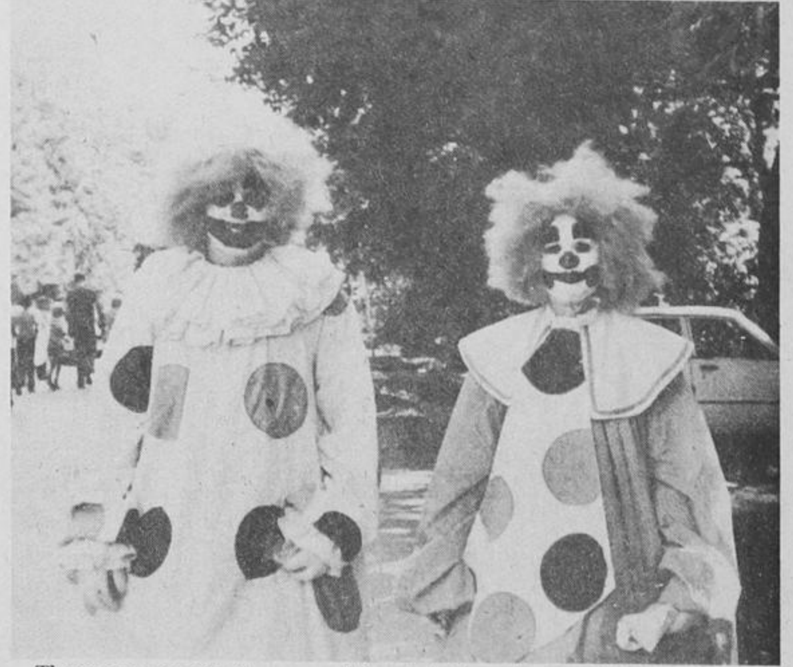
These guys wouldn't say anything, let alone divulge their names. They were appreciated by kids and parents alike.