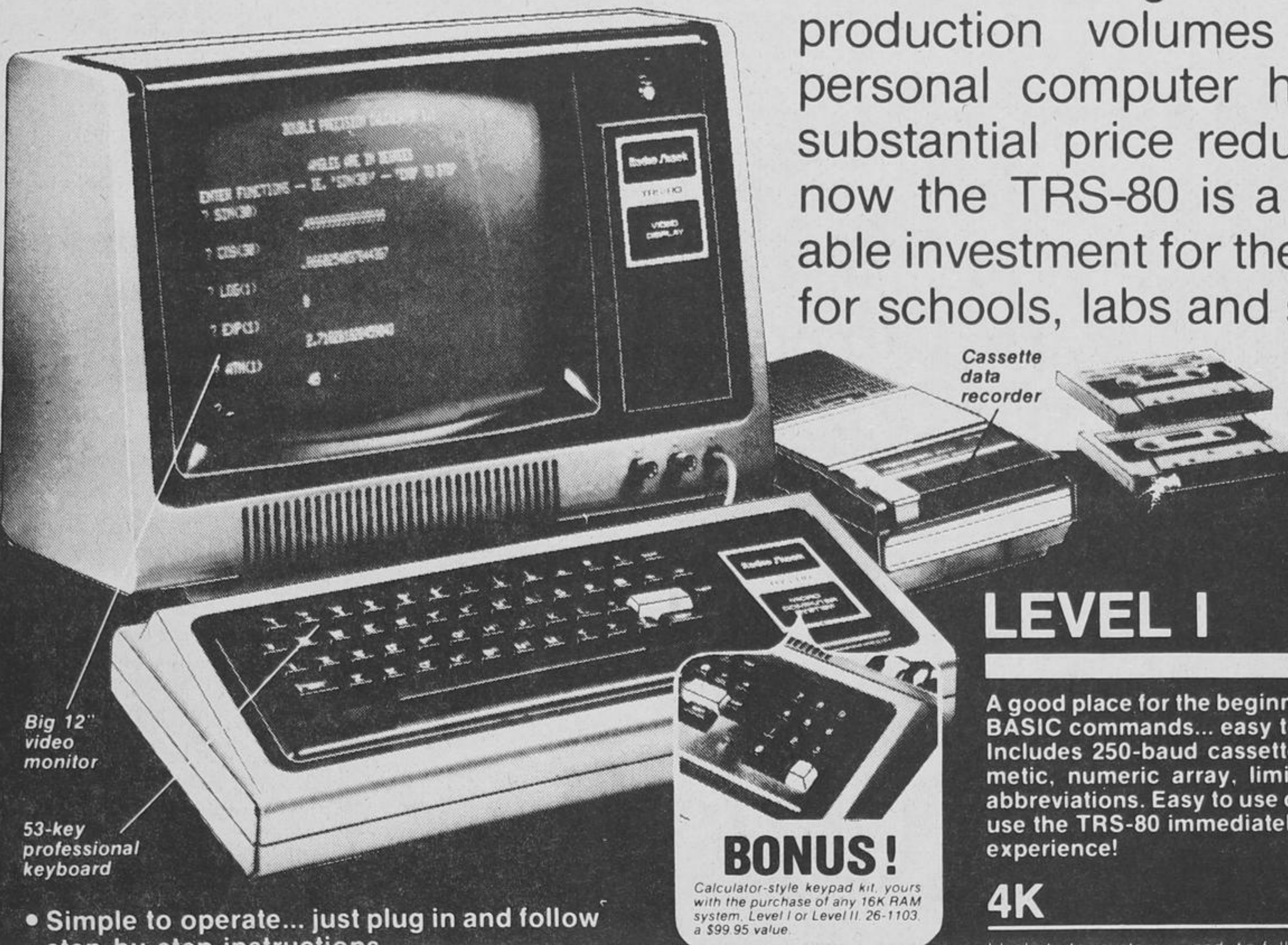
Big 12" video monitor 53-key professional keyboard

Latest technological advances and high production volumes of our unique personal computer have made these substantial price reductions possible... now the TRS-80 is a practical, affordable investment for the home, as well as for schools, labs and small businesses.