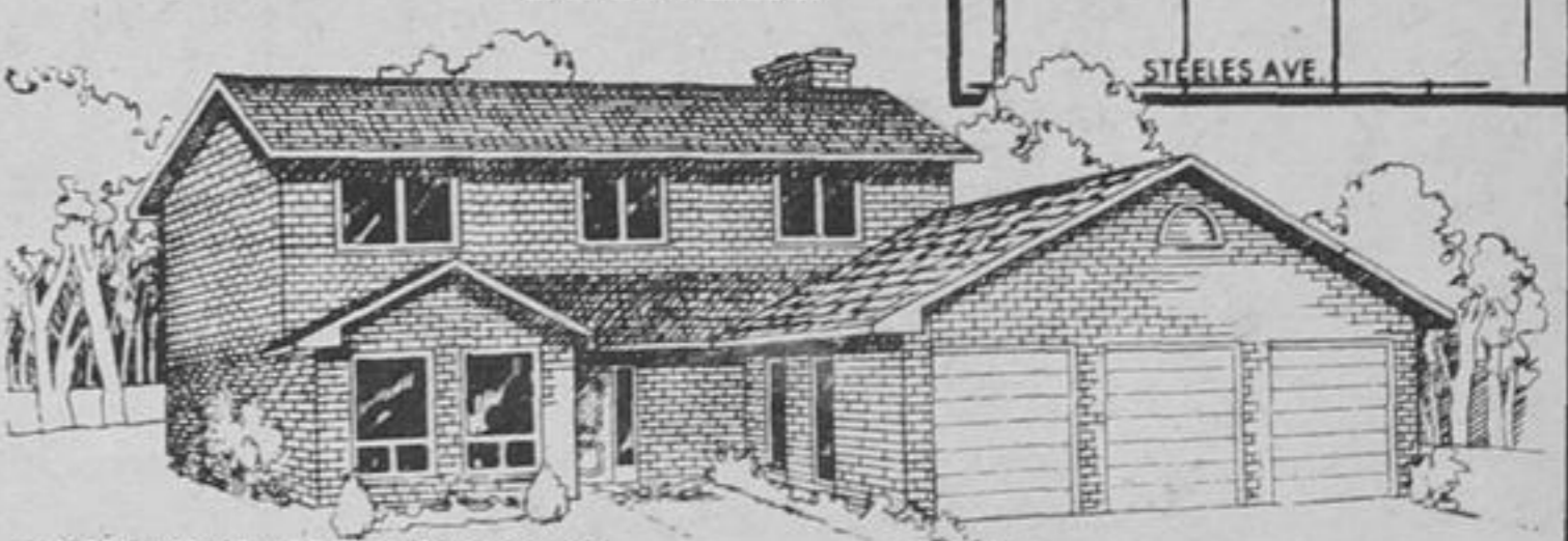
THE REDWOOD APPROX. 2,000 SQ. FT.