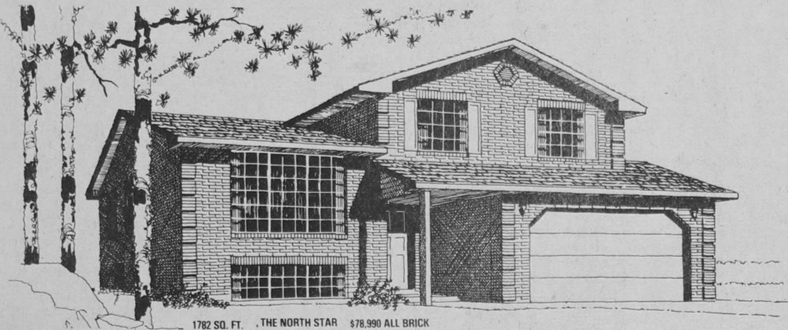
1782 SQ. FT. THE NORTH STAR $78,990 ALL BRICK

CUSTOM STYLED CANAC KITCHENS; LUXURIOUS CUSHION FLOORING; MAHOGANY INTERIOR WOOD TRIM AND DOORS; CHOICE OF ALL BRICK OR BRICK AND ALUMINUM ELEVATIONS WITH QUOINED CORNERS AND PAVED DRIVES