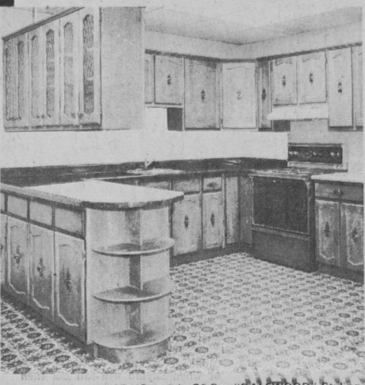
Illustrated Above Is An Example Of Our "DALEWOOD" Styling.