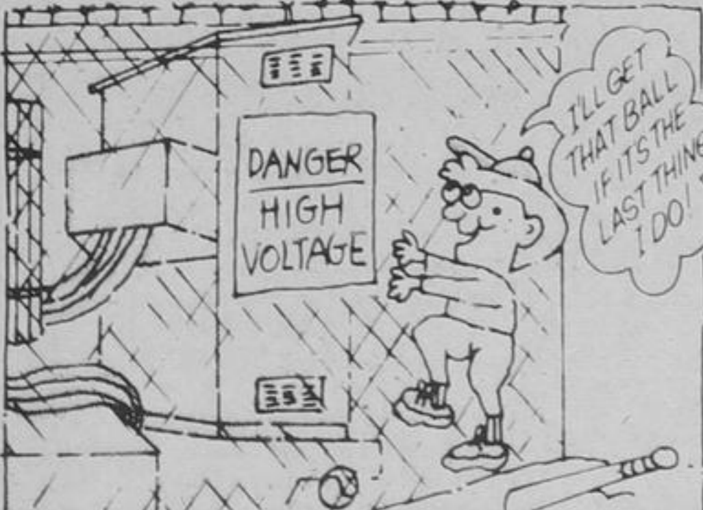
They ignore Danger signs.