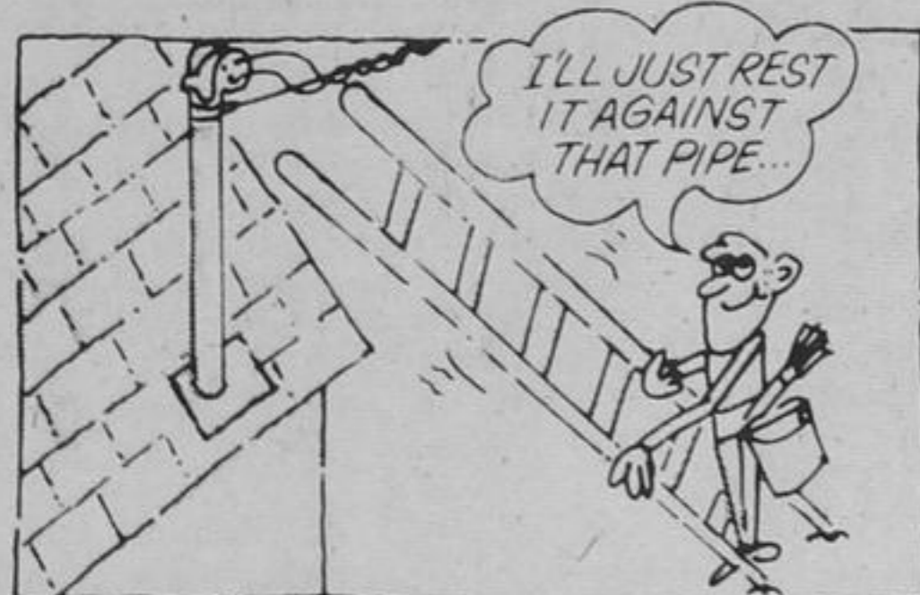
They don't realize that most ladders can conduct electricity.

Shocking experiences with electricity are so easy to avoid. Yet some people still take risks that can take lives.