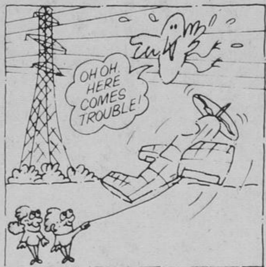
They fly planes and kites near power lines.