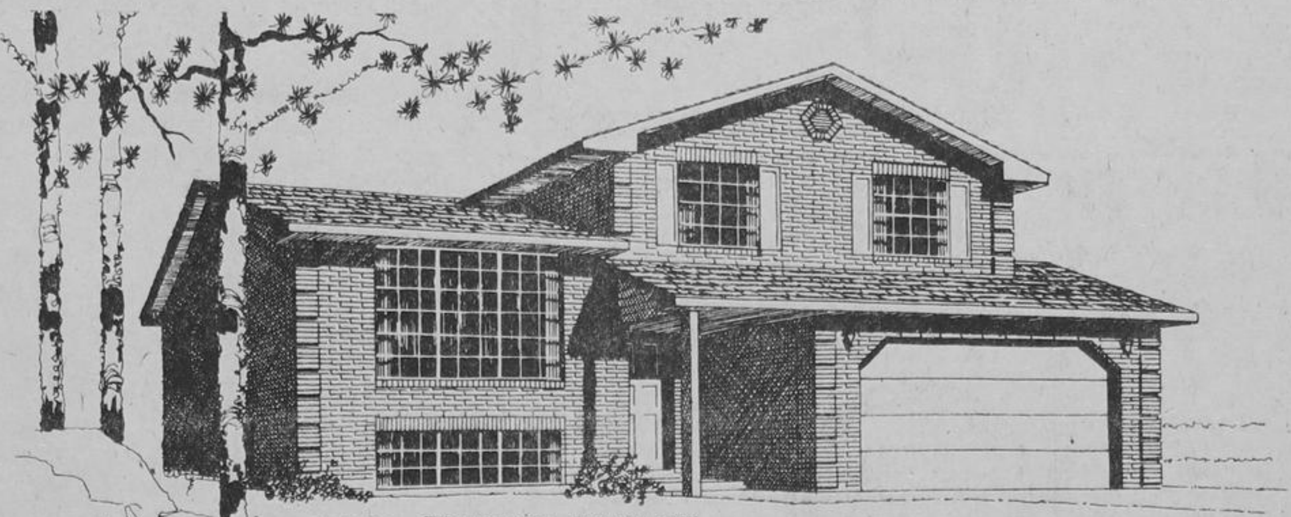
1782 SQ. FT. THE NORTH STAR $78,990 ALL BRICK

CUSTOM STYLED CANAC KITCHENS; LUXURIOUS CUSHION FLOORING; MAHOGANY INTERIOR WOOD TRIM AND DOORS; CHOICE OF ALL BRICK OR BRICK AND ALUMINUM ELEVATIONS WITH QUOINED CORNERS AND PAVED DRIVES