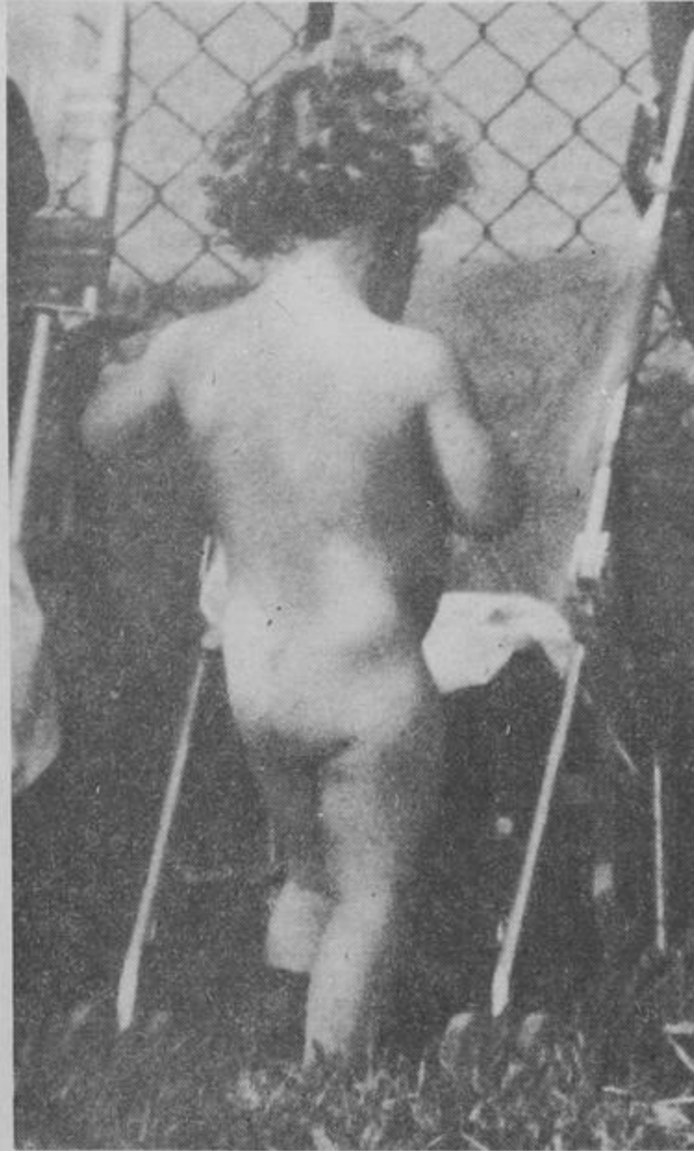
This young lady knows how to keep cool.