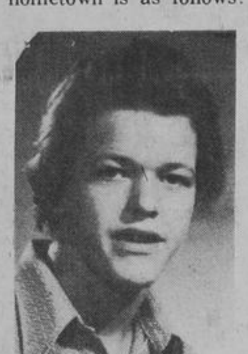
DONALD FRASER Celebrity swimmer

A complete list of the performers and their hometown is as follows: