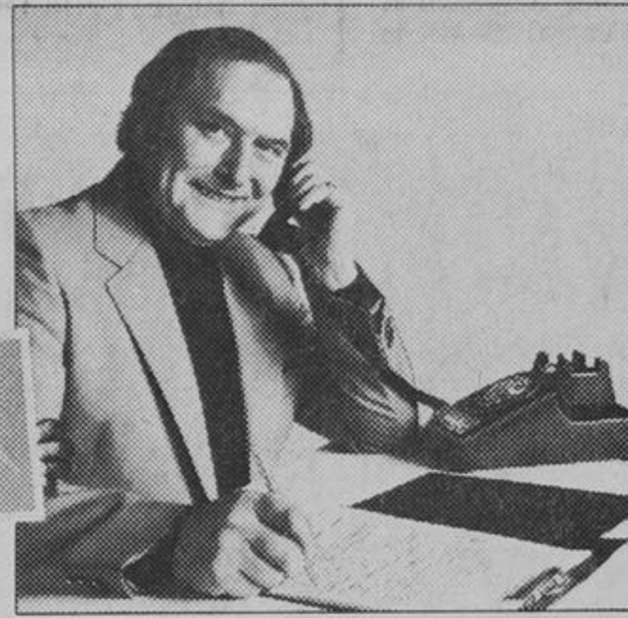
You'll need a dealer who's easy to get in touch with now and in the future. You'll need a dealer like an Alcan Authorized Dealer.

An Alcan Authorized Dealer not only carries our products, but our name and the reputation which goes with it. That's why you'll find him to be everything a dealer should be. He'll offer you his advice on the exterior renovation you have in mind. He'll give you a free written estimate. He'll do the job professionally and as quickly as possible. Alcan Authorized Dealers are independent businessmen appointed by Alcan, and they carry a full selection of Alcan home improvement products.