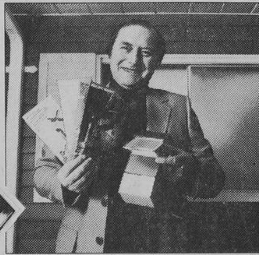
You'll need a dealer who can help you with styles and colours.