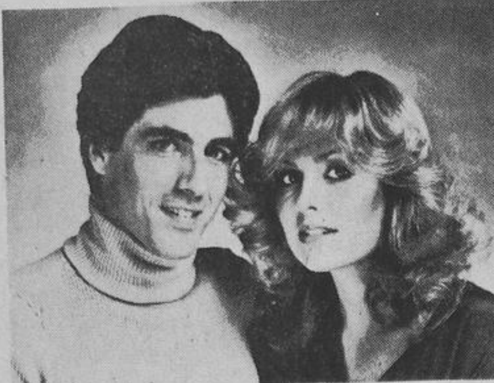
"HIS 'N' HERS" HAIRSTYLES this spring will be neat, well groomed and natural looking. Blow dryer and curling iron keep hers looking soft and very feminine; his requires only a blow dryer and comb. But these popular styling tools can also rob hair of the precious natural moisture that keeps hair shiny and healthy. One way to maintain that moisture balance is to replace the moisture with shampoo and conditioning products such as the Moisture Quotient system from Helene Curtis.

For daytime at the office, long hair is filtered for lightness, and softly curled for a very feminine look.