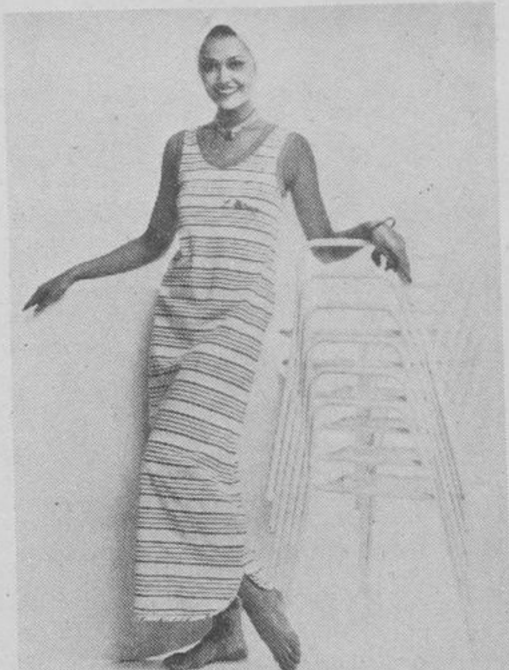
THE ELONGATED TEE-SHIRT is a cool way of dressing for a patio or pool party.