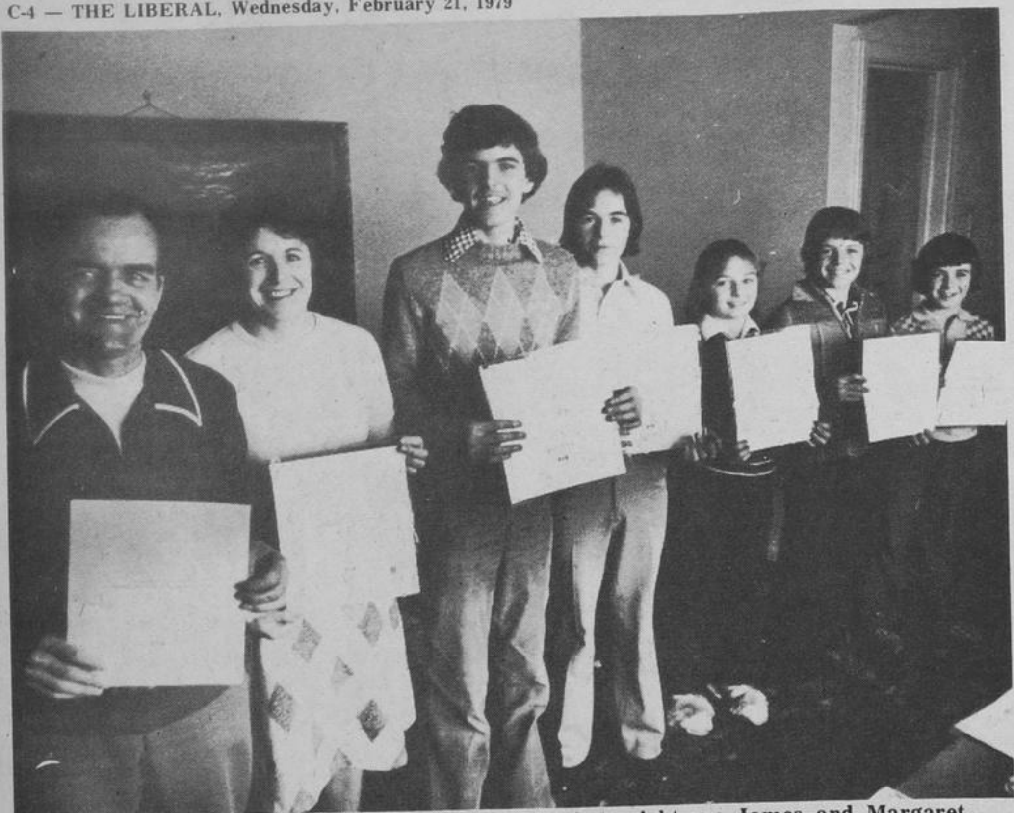
A Richmond Hill family of seven was included in last week's ceremony to swear in new Canadians at Our Lady Queen of the World Church. Pictured