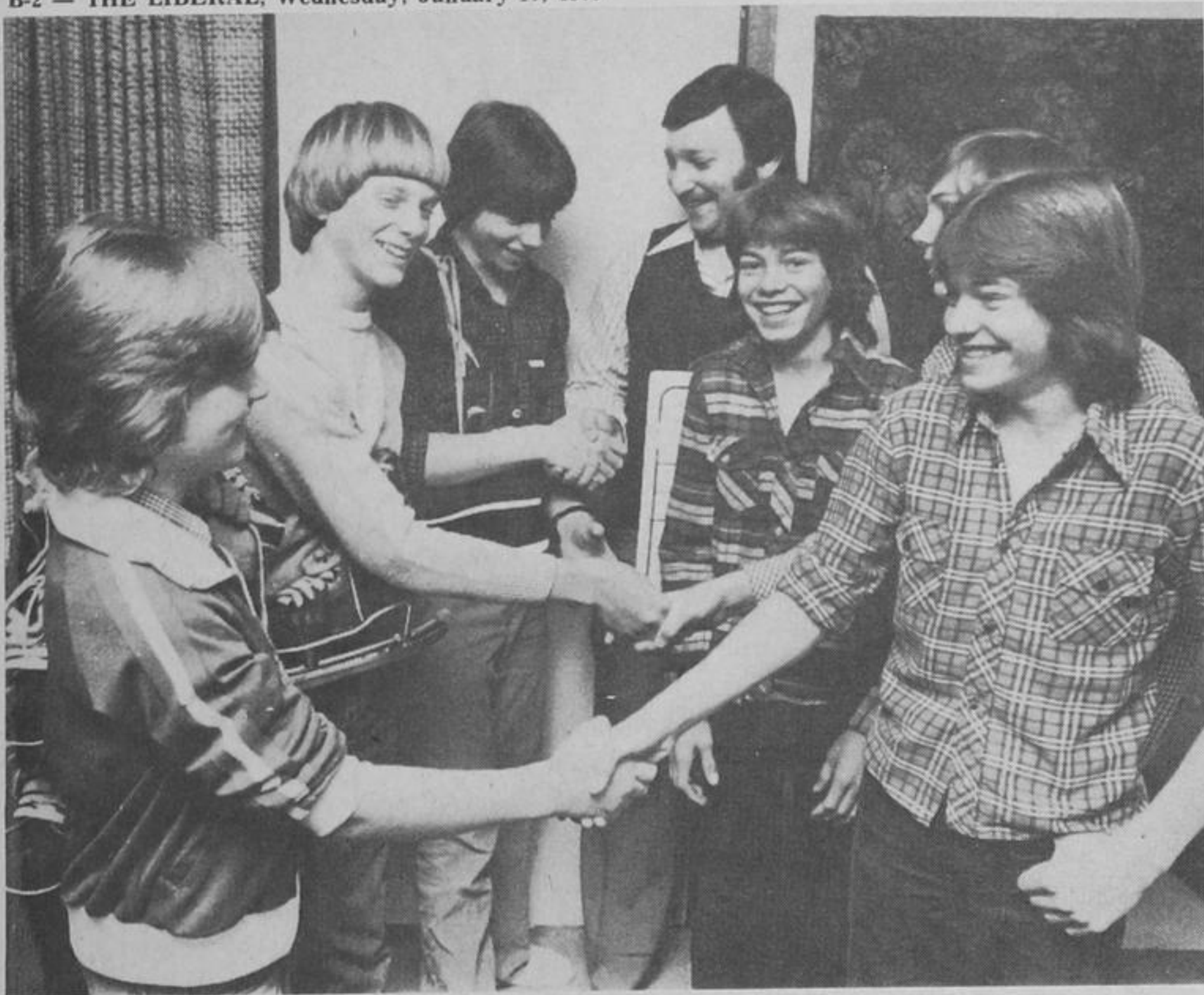
It's shake hands and come out having fun as three visiting minor hockey players from Montreal shake hands with three Thornhill Bantam Select players prior to last weekend's series of exhibition games at Markham and Thornhill. Looking on is