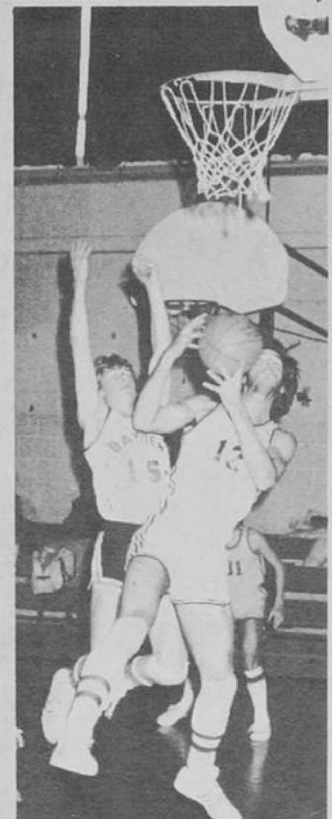
A Bayview Secondary School player attempts to defend in recent tournament play in junior basketball. The regular season is now underway with Bayview sweeping Thornhill in junior and senior encounters last week.