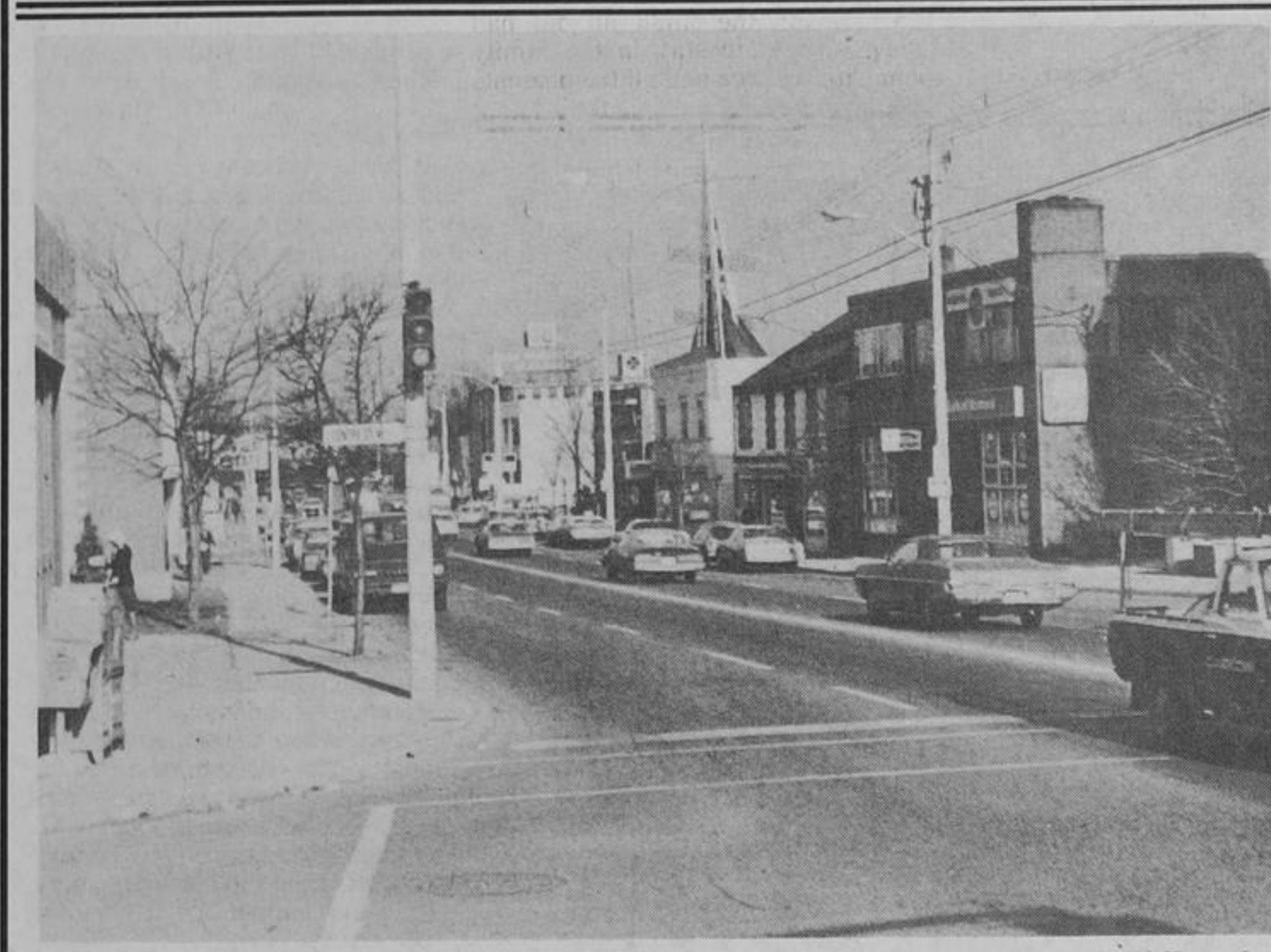
Looking north from Centre Street in downtown Richmond Hill presents drastically different views between 1952 (top) and today. Structures which housed the Canadian Tire store and a Red and White food store, still stand, but their