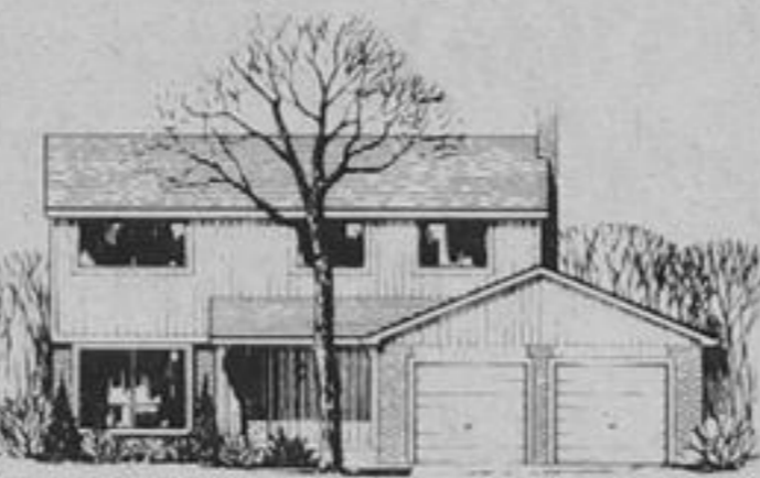
Artist's Conception $86,950

Detached with 2-car Garage Finished Floor Area 2,460 sq. ft. Separate Living Room Separate Dining Room Bedrooms 4 Bathrooms 4 Family Room Recreation Room with floor-to-ceiling fireplace Basement Walk-out