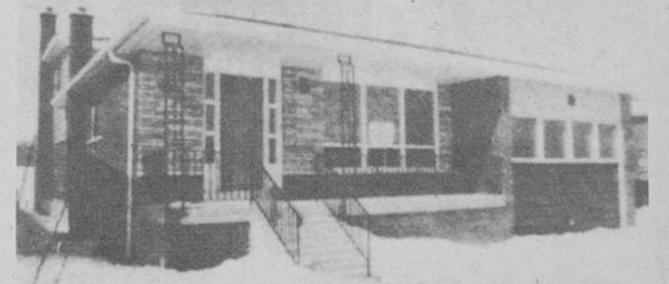
MAPLEWOOD MODEL - 4 BEDROOMS

Offering the extras that make our houses your home Start at $61,500