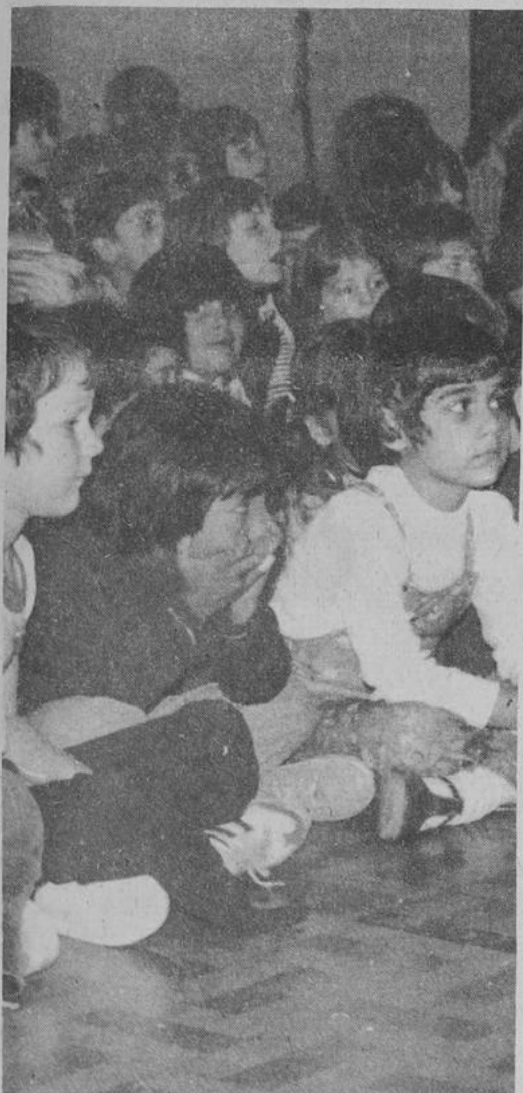
Junior members of the school act as critics for the all-star jug band's performance