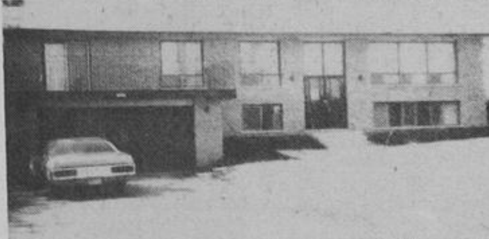
RICHMOND HILL NORTH 2.9 ACRES

Plus 3 bedroom ranch style bungalow, living room with a stone fireplace, dining room with w-o to patio, family room or den with fireplace, plus recreation and games room. Call Bunny Sorley 727-9495.