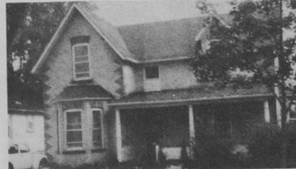
AUTHENTIC VICTORIAN HOME

4 bedrooms, family room, recreation room, separate dining room, den, large kitchen, 2 fireplaces, 3 baths, 2-car garage. Immaculate condition. Call Oswald Garcia, 727-9495 or 889-0282.