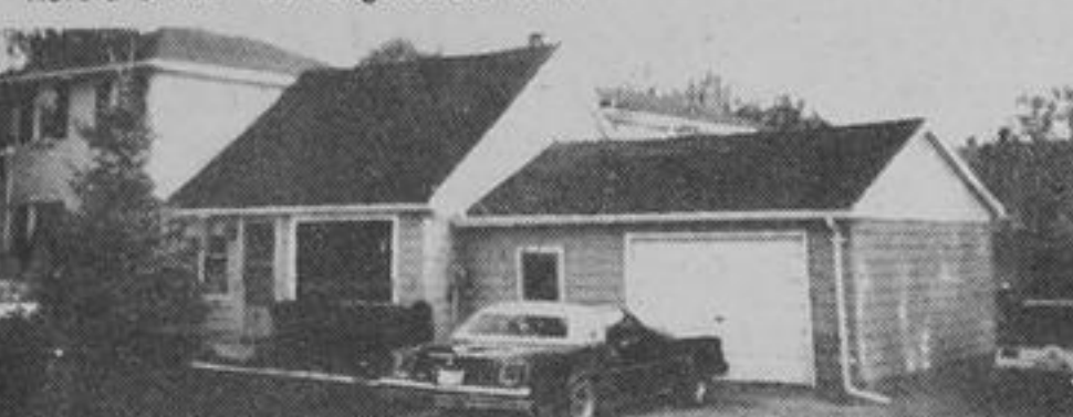
RICHMOND HILL NORTH $57,500

Aurora 727-9495 Direct Toronto Line 889-0282