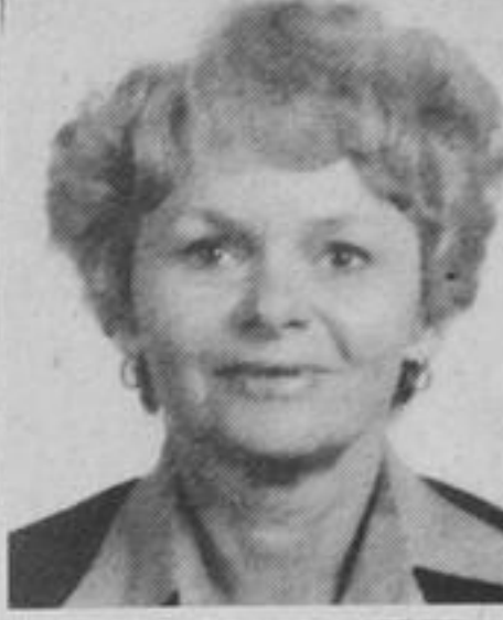
MRS. ERIKA WEBER

Off Yonge St. N. Hwy. 7 you will find this 3 bedroom side-split which is secluded & peaceful yet provides every modern convenience plus sep. cozy apartment with own entrance & log burning fireplace. Vendor will hold 1st mortgage at 10% open. Call Tanya Gutowska 481-3443 or 223-1203.