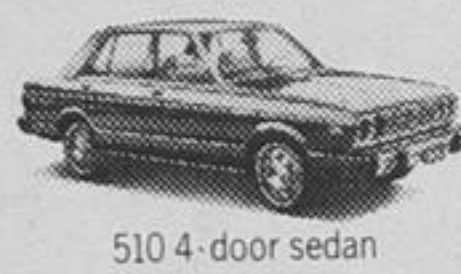
510 4-door sedan

Whatever you need in a '78, you're on the right track at your Datsun Dealer.