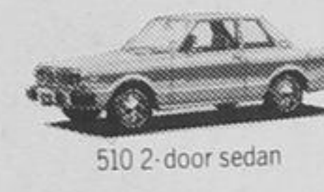
510 2-door sedan