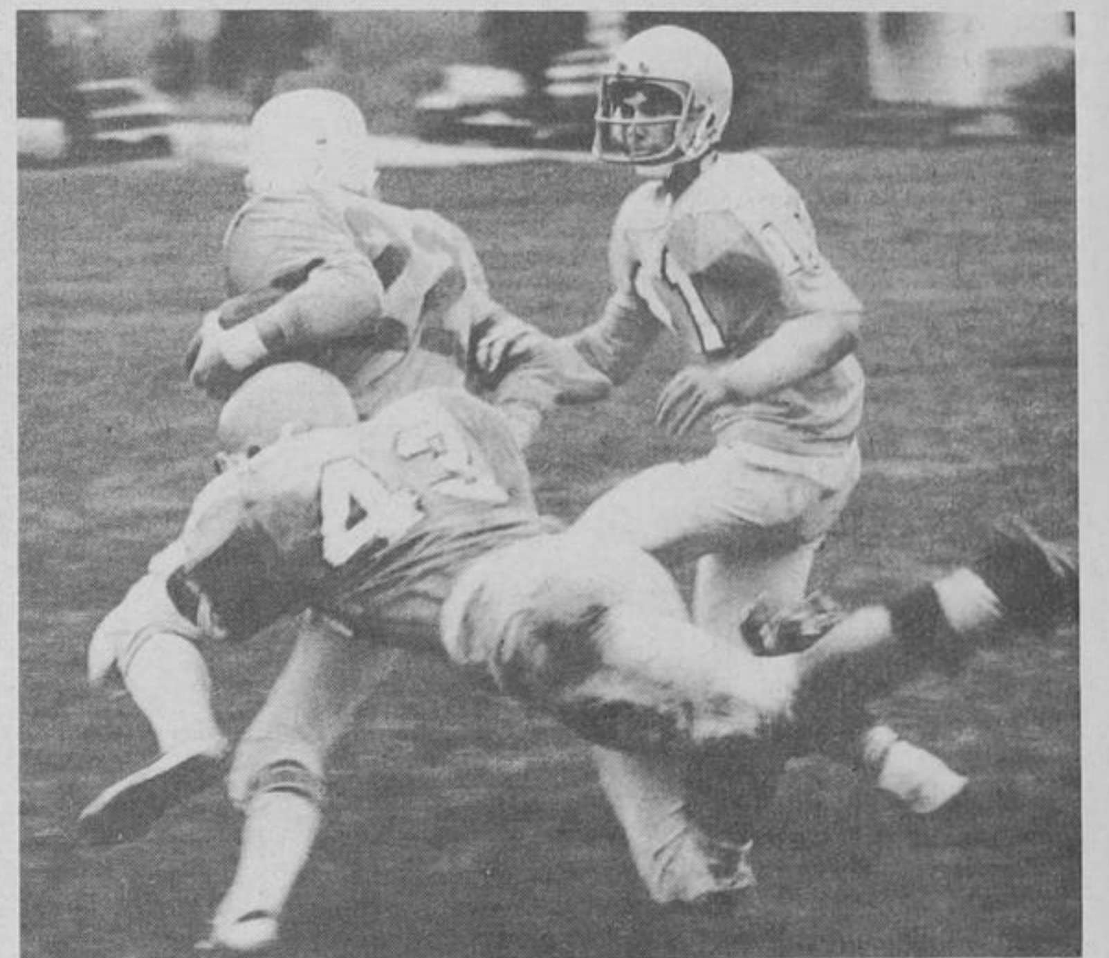
Going some place?