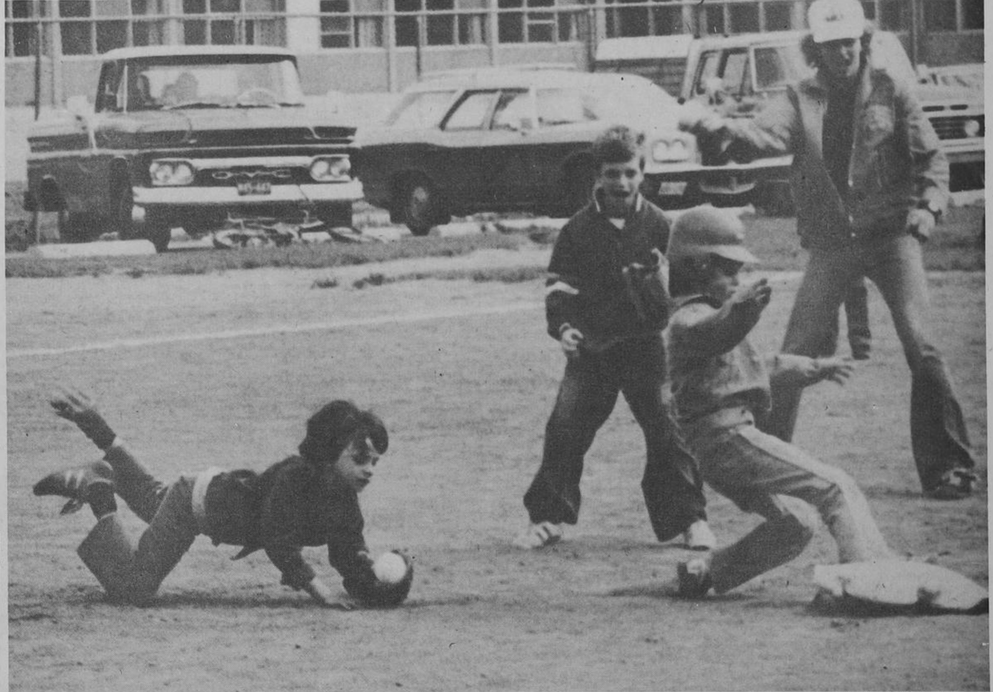
Hard on the elbows