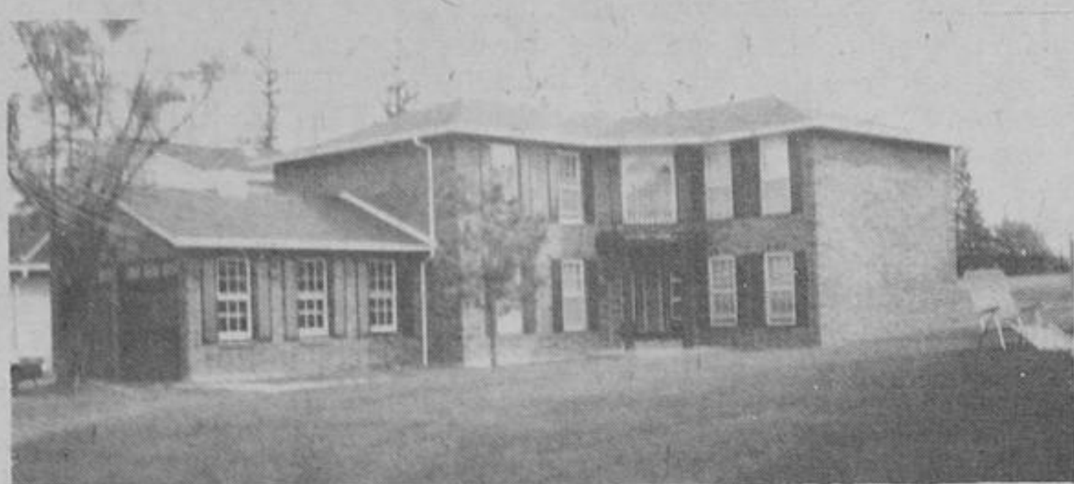
$178,900 Artist's Conception

North on Yonge past Newmarket to Holland Landing—22 miles North of Yonge/Finch subway