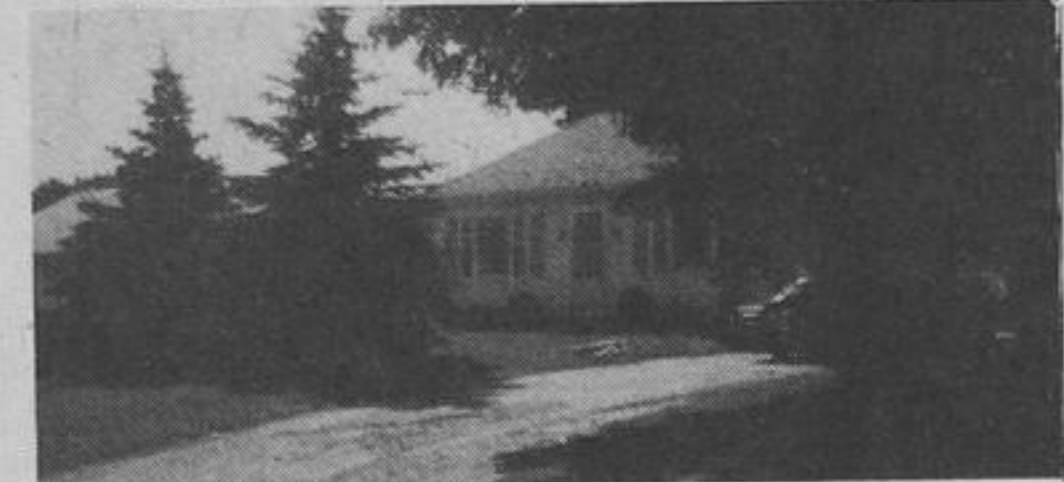
Aurora — Quiet street off Yonge. Detached, with garage, mature trees, various extras. Near schools, stores, delightful setting in nice area $55,700. Call John Moss.