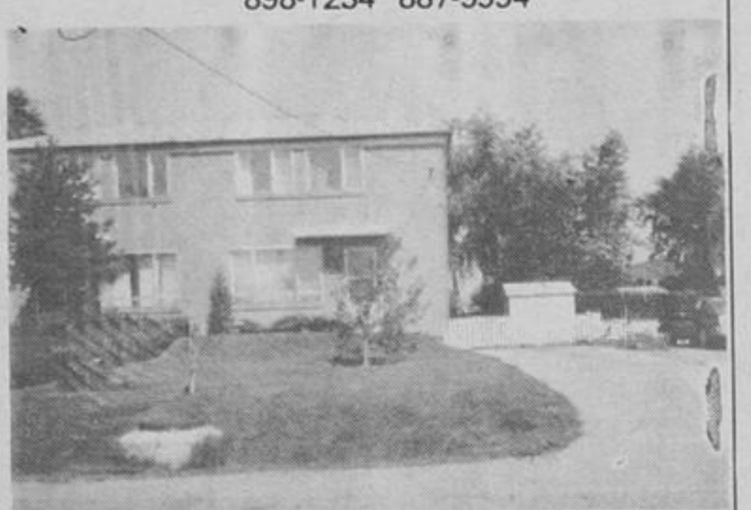
Bluegrass Blvd — Just listed, 3 bedroom 2 storey brick semi in a desirable area, fenced yard, paved drive, mature trees won't last at only $53,900. Call Bob Walton.