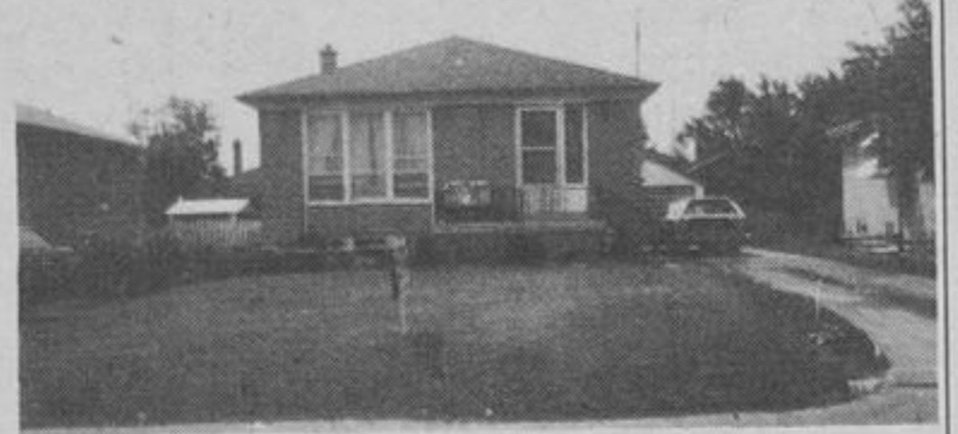
Just listed — Richmond Hill, 4 bedroom brick bungalow on Lynett Cres., broadloom throughout, paved drive, detached garage and finished basement $65,900. Call Bob Walton.