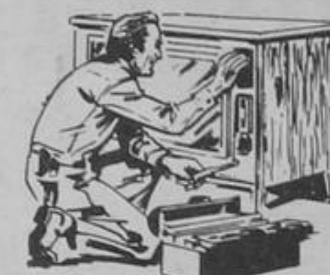
EXPERIENCED TECHNICIAN REASONABLE RATES