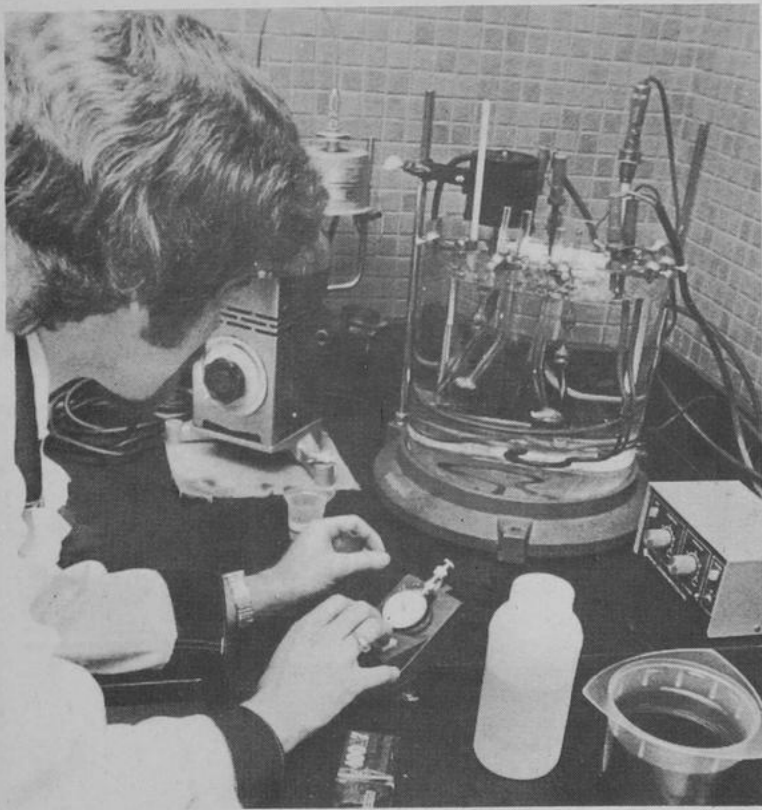
In the laboratory

Fluids are tested for particles and dirt which will help determine the amount of damage to machines brought into Crothers for overhauls.