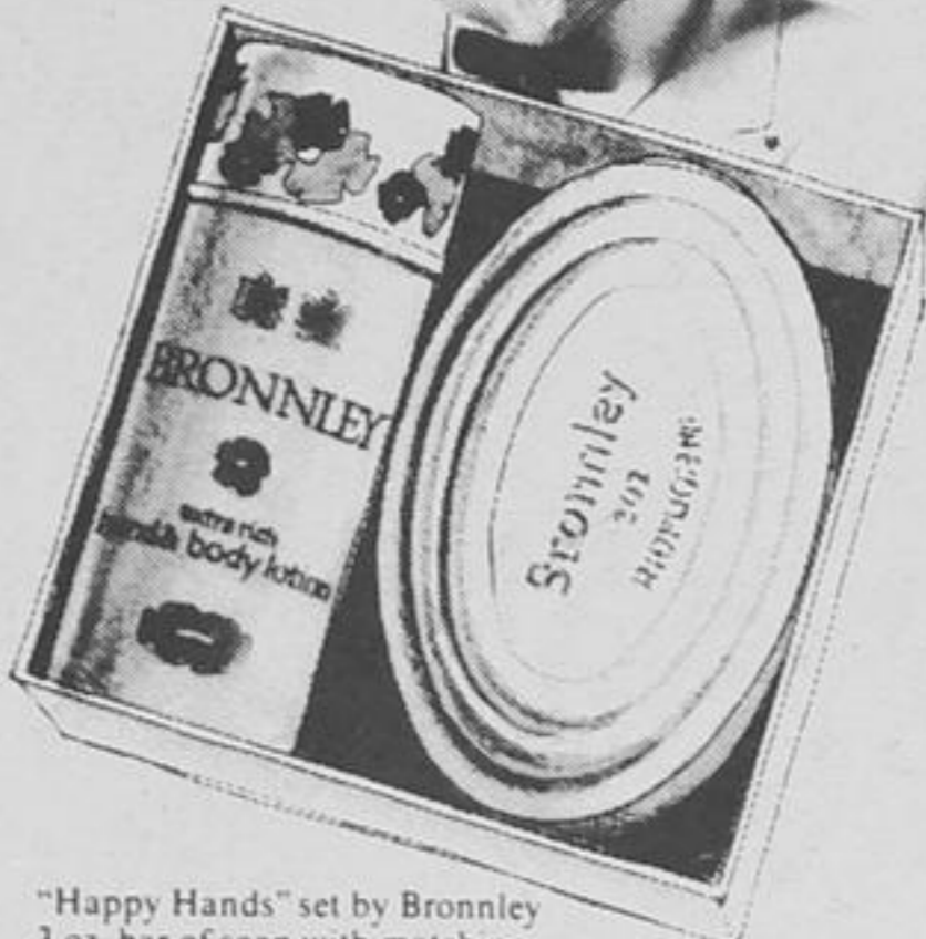
"Happy Hands" set by Bronnley 3 oz. bar of soap with matching 1 1/4 fl. oz. hand and body lotion. Retail value $1.50.

Col. Sanders' Recipe Kentucky Fried Chicken A CANADIAN COMPANY