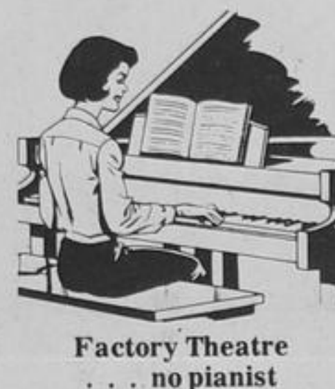
Factory Theatre ... no pianist