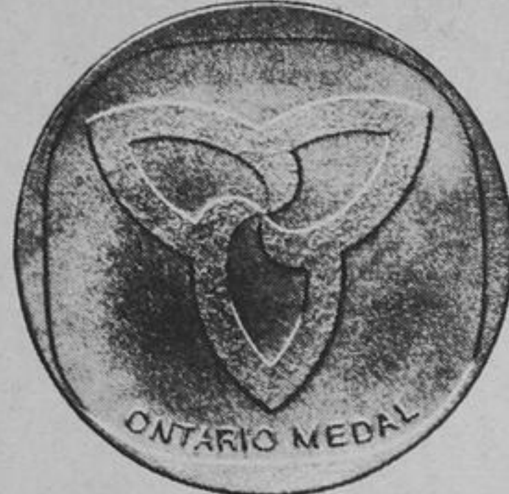
ONTARIO MEDAL FOR GOOD CITIZENSHIP

Making a nomination is itself an act of appreciation for good citizenship. All nominations should be received by April 15, 1977.