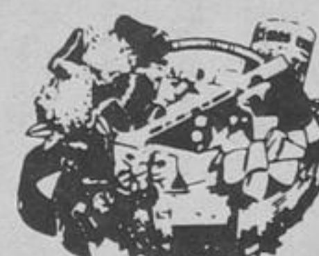
The Most Famous Basket in the World

It's time to call your Welcome Wagon hostess. Phone