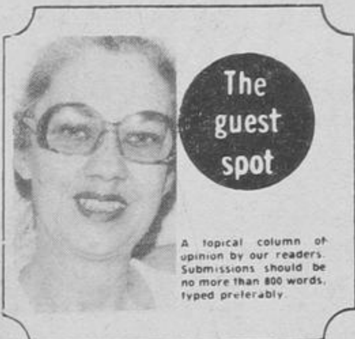
The guest spot

I explained in some detail the awesome significance of a letter received, signed "secretary", which reached us undated, from the office of the Ontario municipal board.