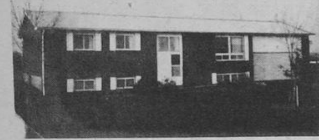
1975 HEATING BILL $185 COMPARES WITH $350-$500