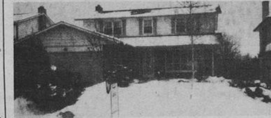
25 PORTREE CRES.

Lovely Thornhill 4 bedroom on quiet cres., backs on parkland, 4 bathrooms, (4 pc. ensuite) main floor family room, fireplace, rec. room, reduced to $105,000. Possession flexible. IRENE BENOIT 889-9330.