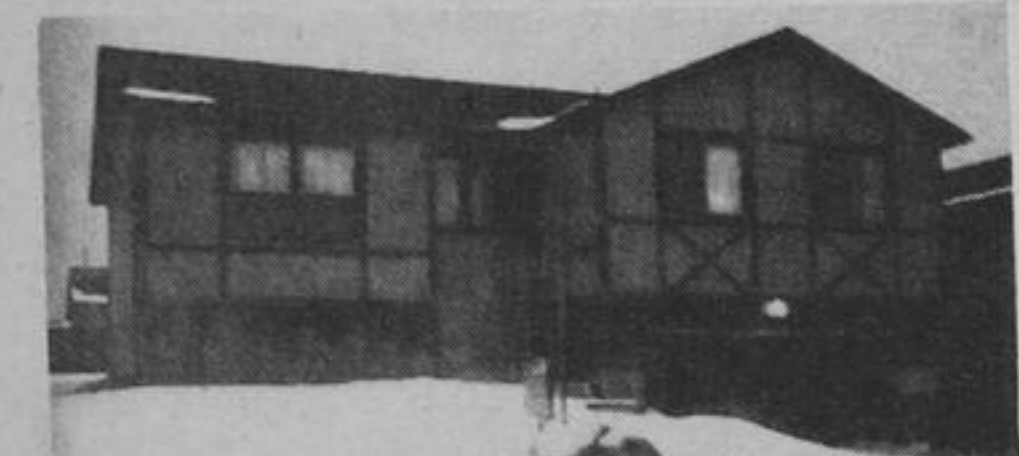
$5,000 DOWN $475 PER MONTH