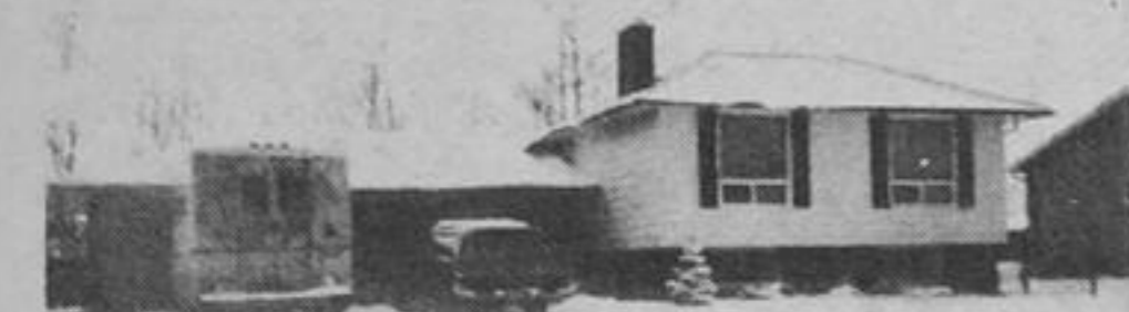
FIREPLACE — WET BAR BEAUTIFUL TREES

3 OUTSTANDING VALUES — easy commuting range to metro — carrying $475-$540 P.I.T. — mortgage interest savings are much more than increased travelling cost (comparable North Metro homes $20,000 higher). 3 bedrooms, brick bungalow, 2 car garage, large lots, 2 baths, fireplace, patio walkouts Call today, ask for Robbie Keller collect 677-7290 or 24 hr. pager service 245-5544 Pager 5791.