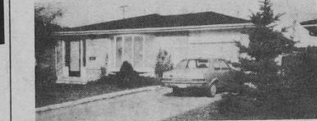
REDUCED TO $72,900

Lovely Thornhill 4 bedroom on quiet cres., backs on parkland, 4 bathrooms, (4 pc. ensuite) main floor family room, fireplace, rec. room, reduced to $105,000. Possession flexible. IRENE BENOIT 889-9330.