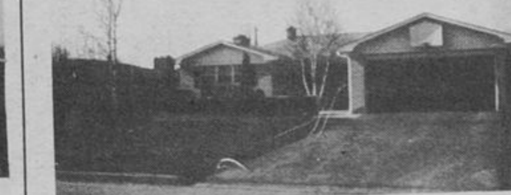
22 DELAIR CRES.

168 Kirk Dr. Brick 3 bedroom Thornhill bungalow. Spotless condition, 1 1/2 baths, built-in dishwasher, central air, ideal opportunity to own a fine, detached home in a desirable community. IRENE BENOIT — 889-9330.