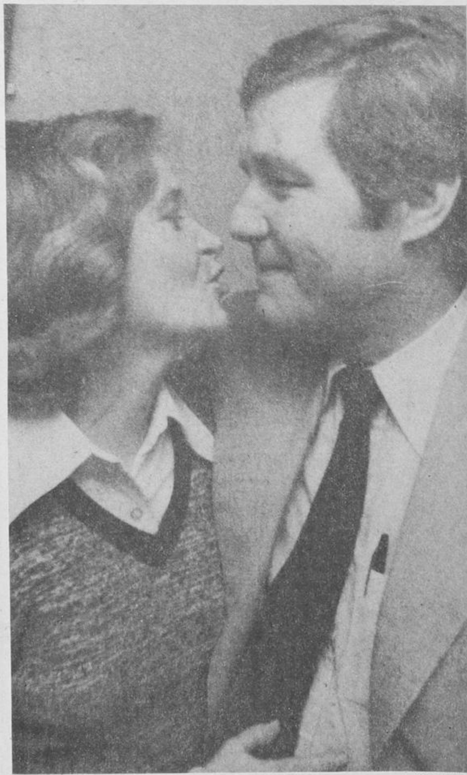
Stand by your man

celebrations after it was all over, and the final results showed the mayor with a comfortable 6051-4281 margin.