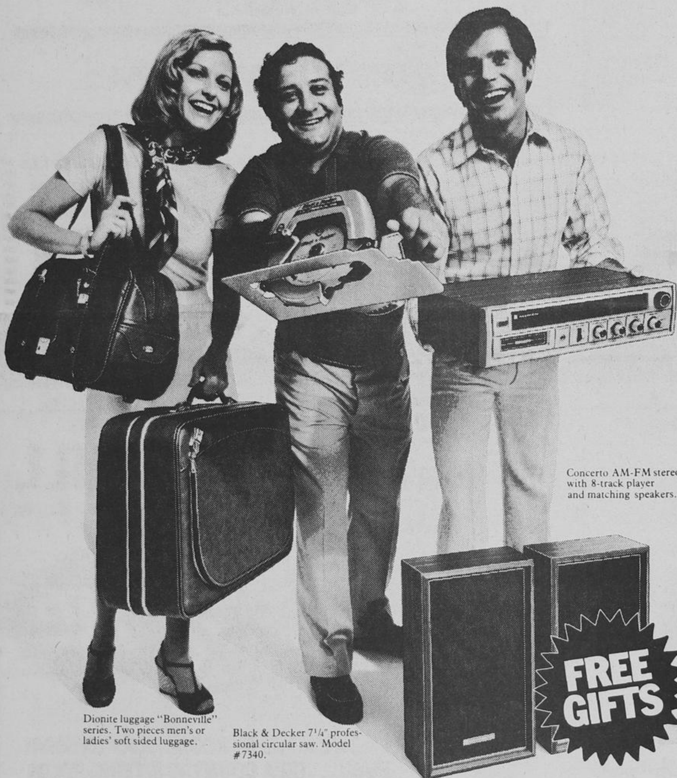
Dionite luggage "Bonnevile" series. Two pieces men's or ladies' soft sided luggage.