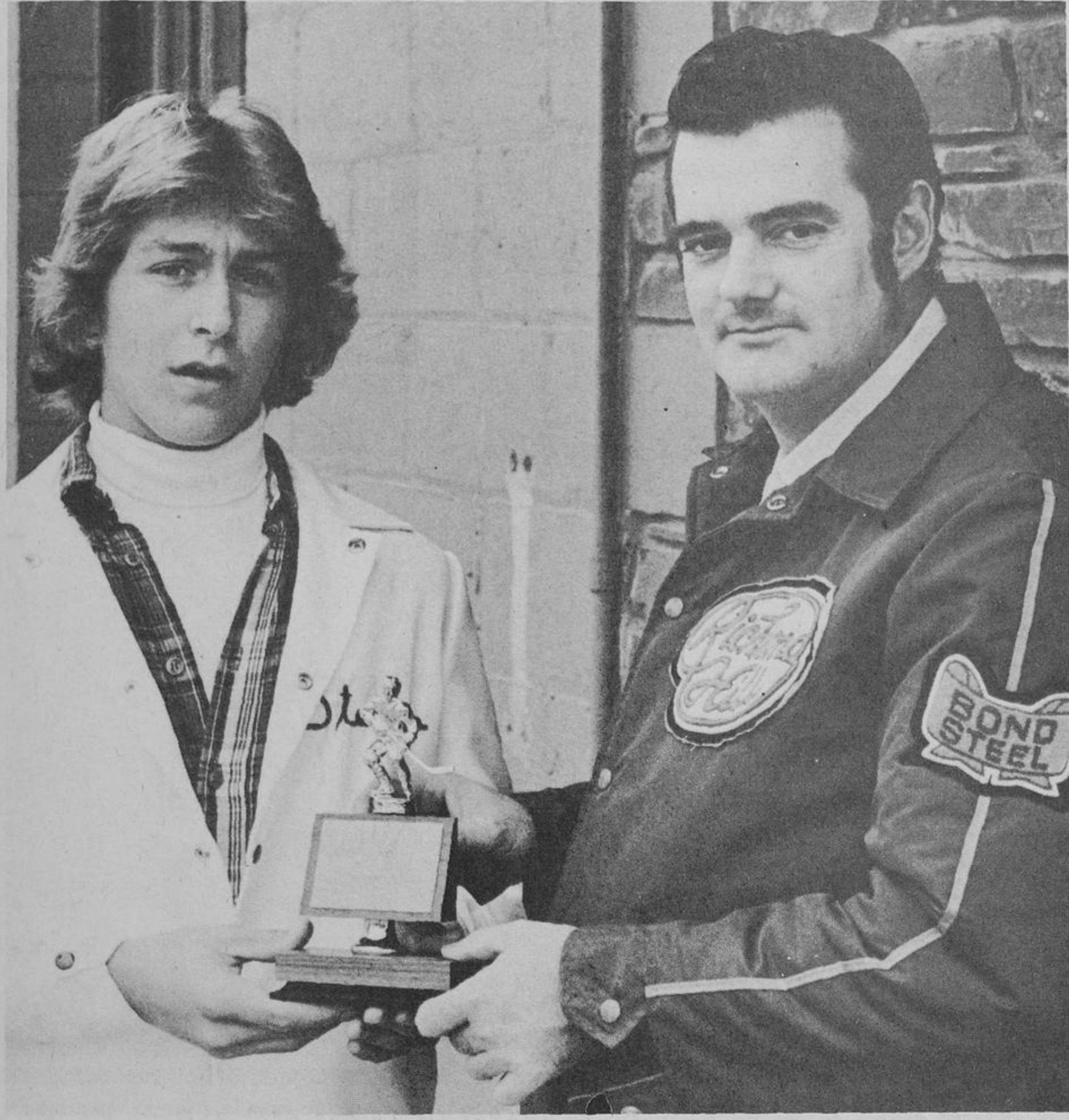
He's very valuable

although I thought we could have made a better showing against them in our opener. "We missed a lot of tackles and that hurt us and even at that it was a close game. We've tightened our defense up since then and I hope it will be a different story next time." The York County semi-finals will be held Nov. 3 with the finals slated for Nov. 6.