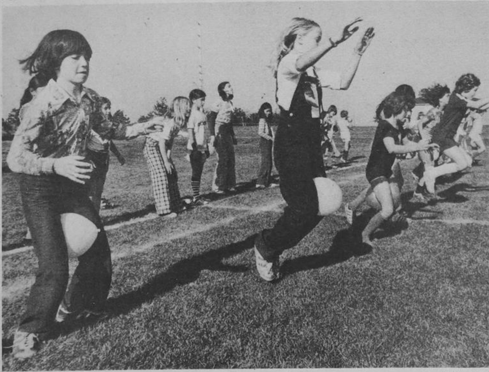
They're off and hopping

It's not easy to run a race when there's a balloon stuck between your legs, but at least these girls all share the same handicap as they take off from the starting line. It was part