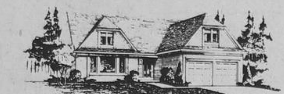
The Sitka Landing Mk V1 - $164,900.