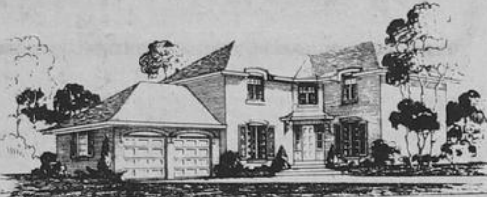
The Satterfield Mk 1 - $183,200.