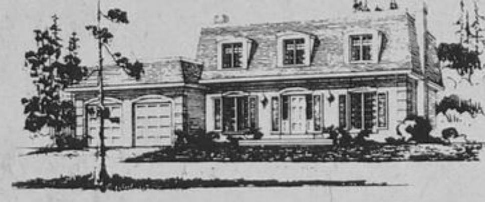
The Saguenay Mk 111 $219,760.