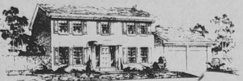
The South Shore Mk 1 - $164,900.