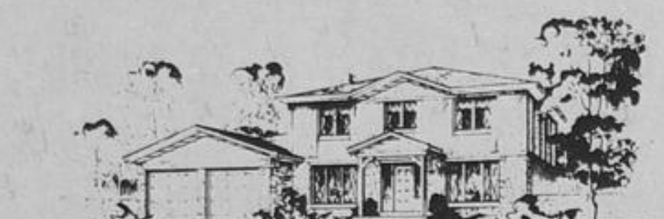
The Sandringham Mk 1 - $171,000.