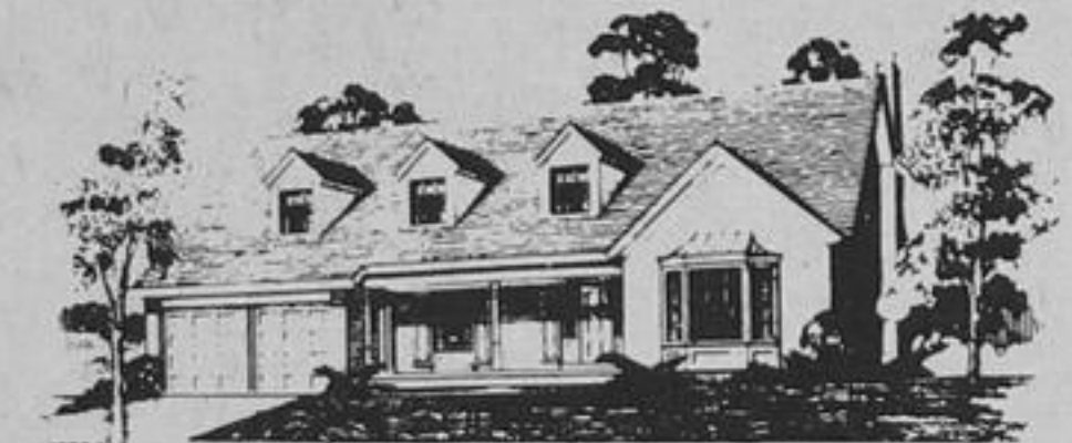
The Snug Harbour Mk 1 - $193,000.