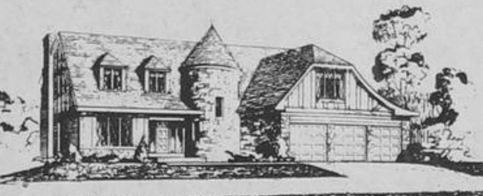
The Southkeep Mk 11 $226,000.

This romantic but intensely practical haven can be yours in one of Toronto's most desirable settings, nestled with a full walkout basement on just about the last true ravine lot in captivity. You'll be the envy of your friends everywhere. Invite them to sip tea on your broad back balcony. Let them intoxicate themselves with the commanding view up and down the winding valley below. Inside again let them see the warm friendly life style your family enjoys in this five bedroom home with its charming entry foyer leading to main floor den, plus family room. More than 3,750 square feet on the upper two floors, not to mention all the fun space down the open spiral staircase to the high bright walkout basement opening to the terraced rear gardens and pool area. Spacious 3 car garage. Where? Would you believe it, in the Bayviews-Steeles area?