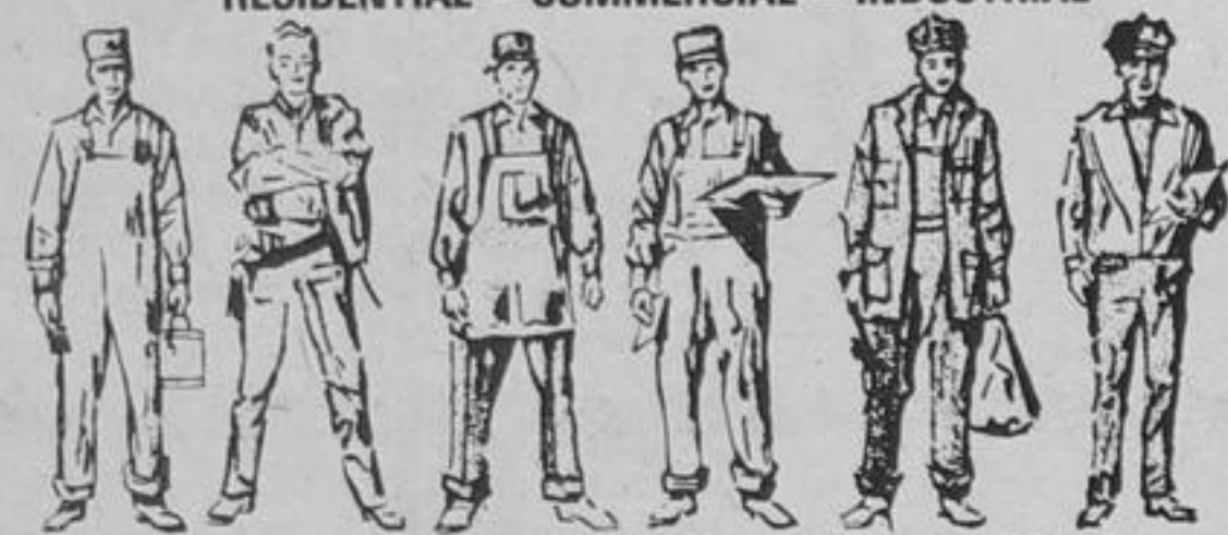
"ONE CONTRACTOR — ONE PRICE"

METRO LICENSE NUMBER B-1508 ADDITIONS RENOVATION ALTERATIONS RESIDENTIAL — COMMERCIAL — INDUSTRIAL