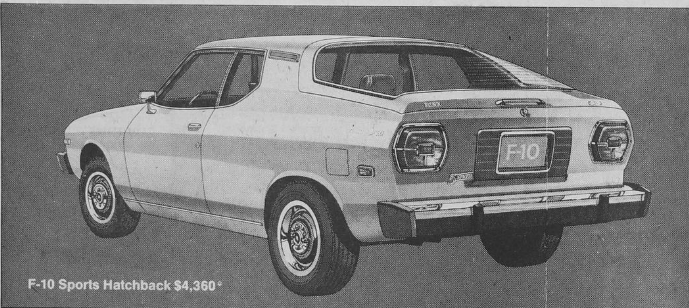
F-10 Sports Hatchback $4,360*

Even our lowest priced 2-door Sedan comes fully equipped with rear window defogger, tinted glass, carpeting, chrome window trim, radial tires, console with package tray, wheel covers, heavy duty battery, bumper over-rider and flow-through heating and ventilation.