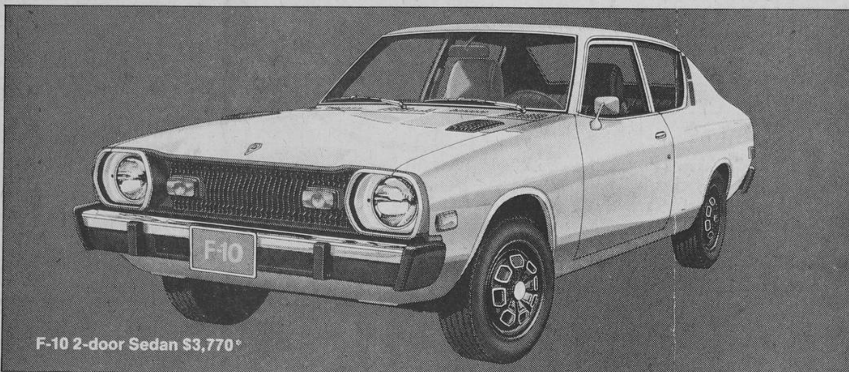
F-10 2-door Sedan $3,770*