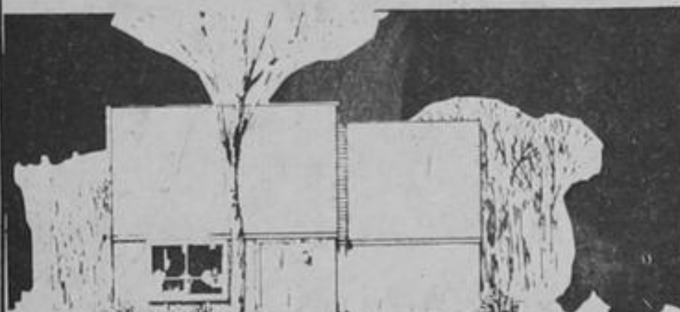
Glengarry 1,323 sq. ft. Finished Floor Area $49,900

SECOND PHASE NOW OPEN Detached Homes $49,900 to $58,900