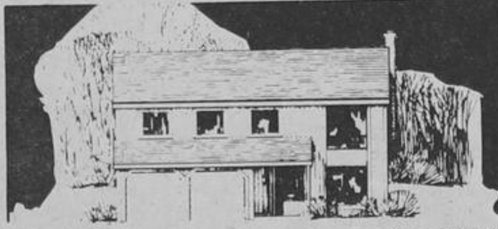
Norfolk 1,749 sq. ft. Finished Floor Area $55,900