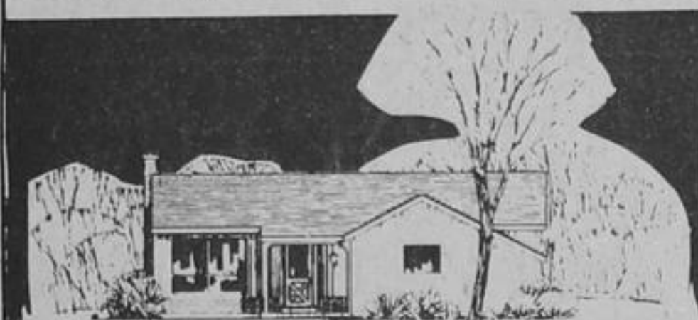
Dufferin 1,182 sq. ft. Finished Floor Area $54,900