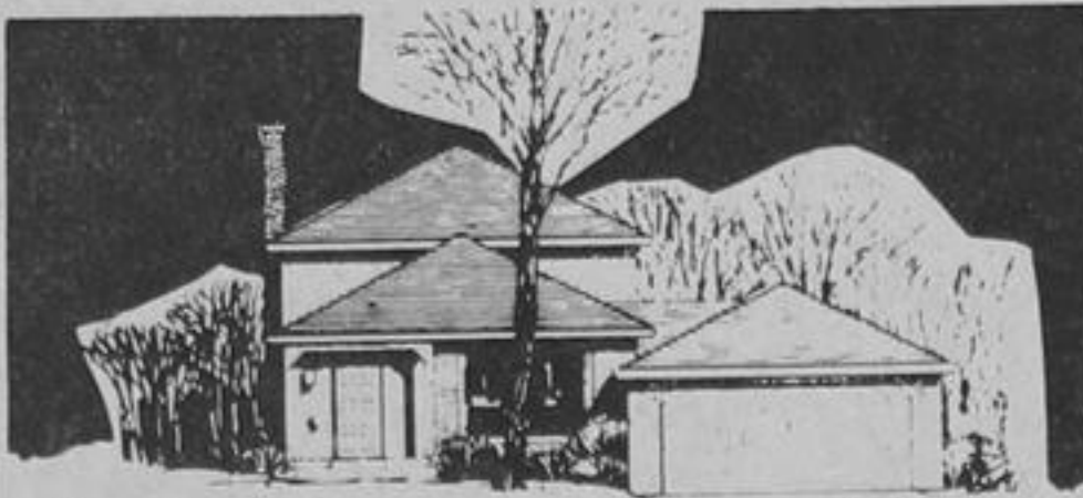
Kent 1,592 sq. ft. Finished Floor Area $58,900