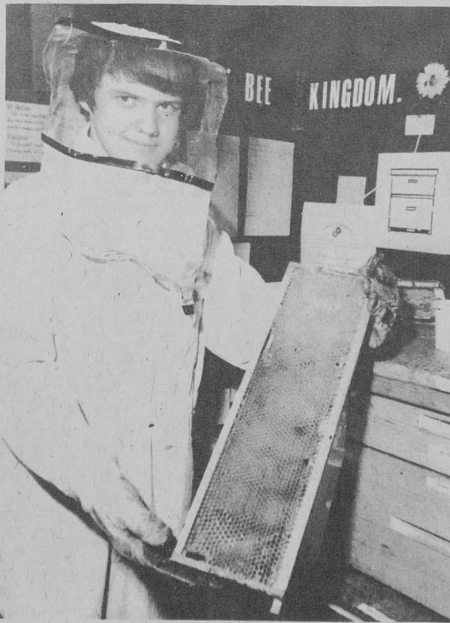
Kingdom of bees