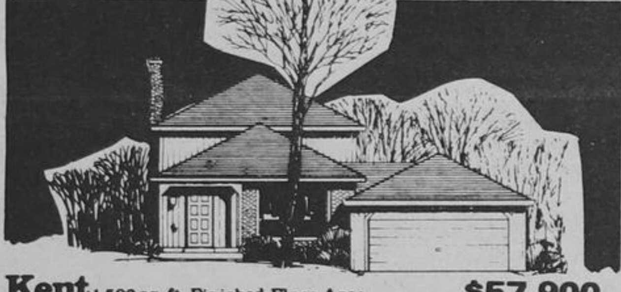
Kent 1,592 sq ft Finished Floor Area $57,900