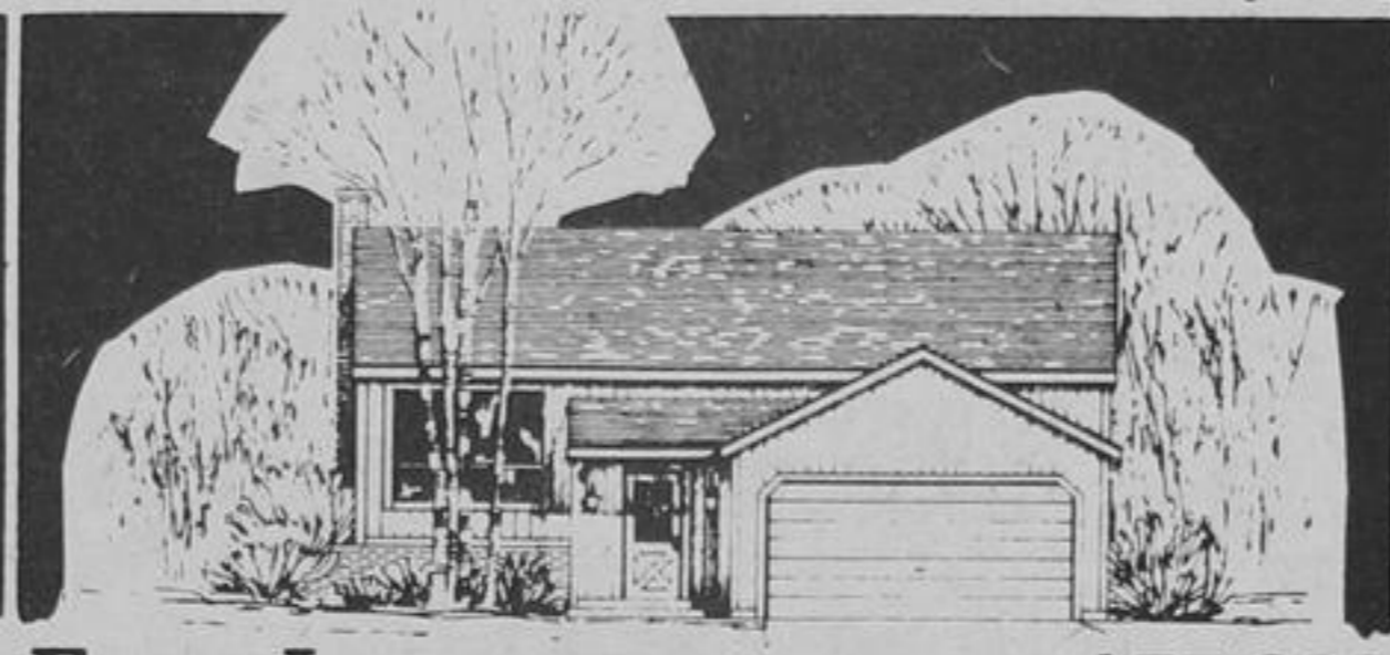
Essex I 1,835 sq ft Finished Floor Area $55,900