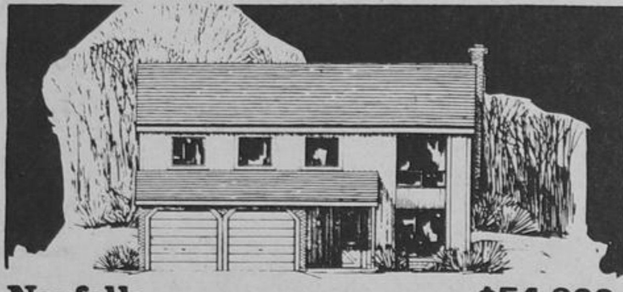
Norfolk 1,749 sq ft Finished Floor Area $54,900