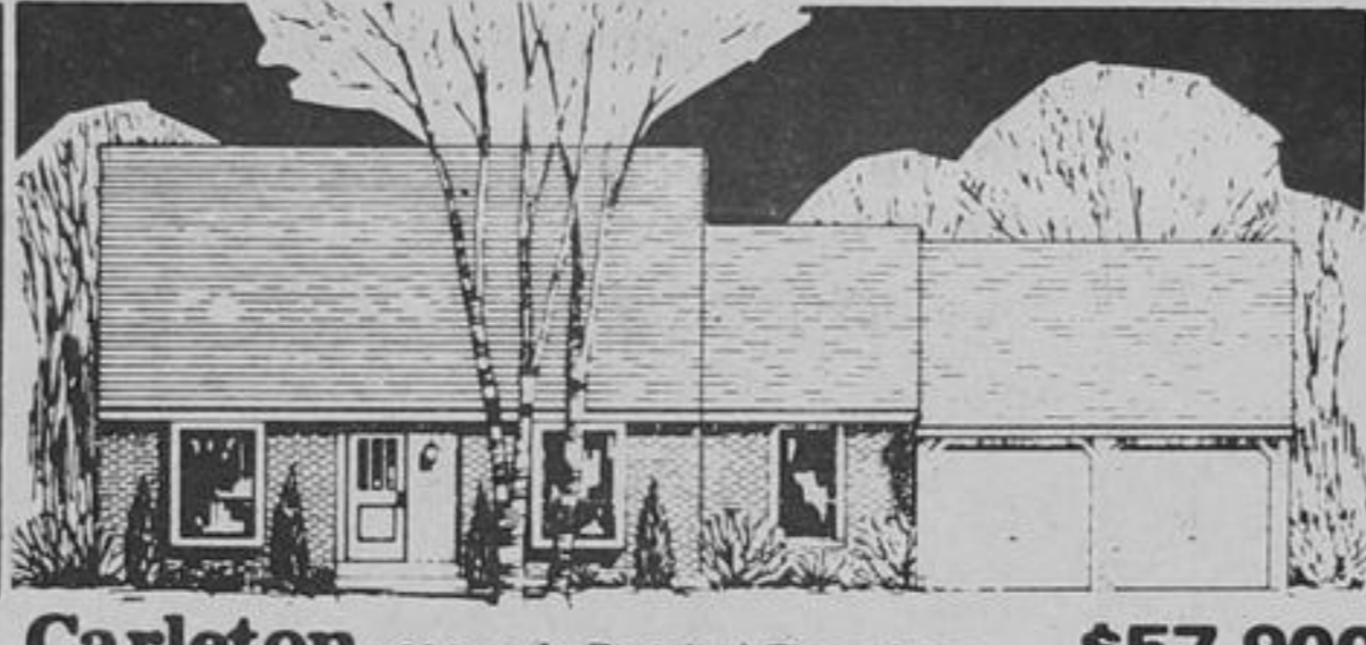
Carleton 1,828 sq ft Finished Floor Area $57,900