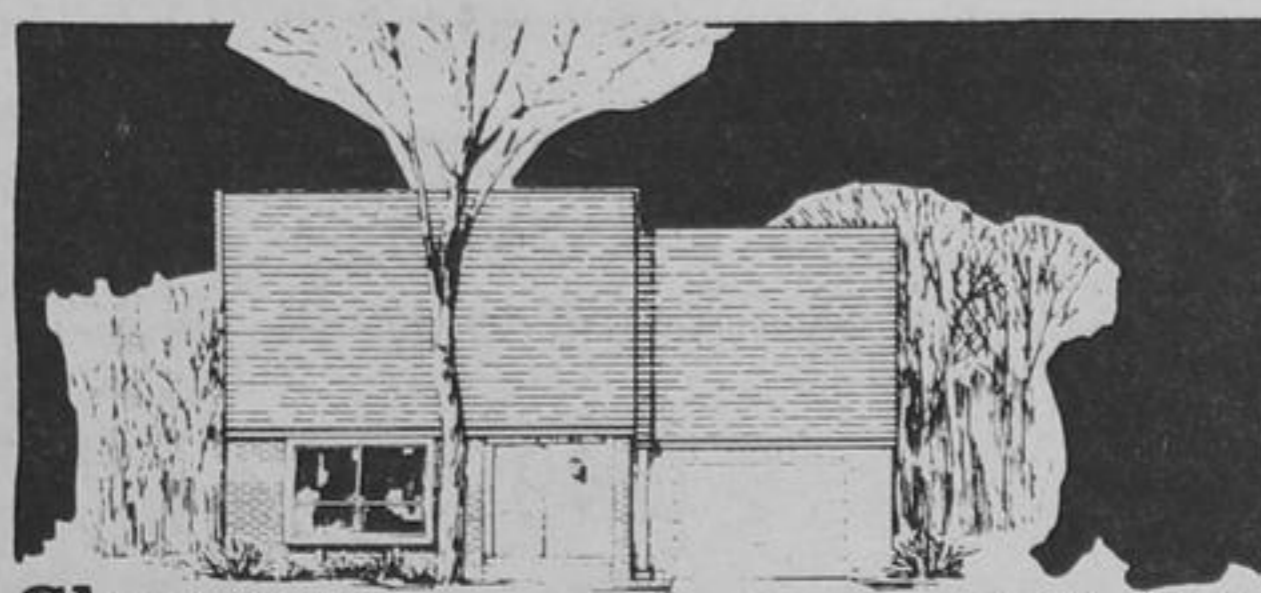
Glengarry 1,323 sq ft Finished Floor Area $49,900