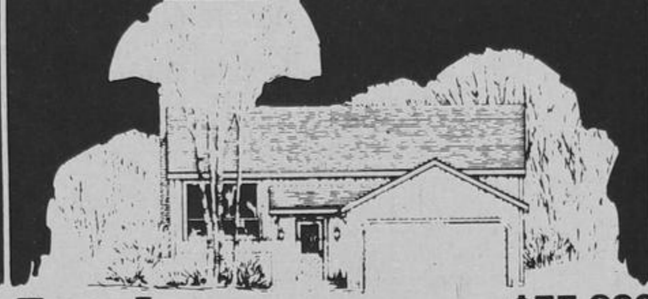
Essex I 1,835 sq. ft. Finished Floor Area $55,900