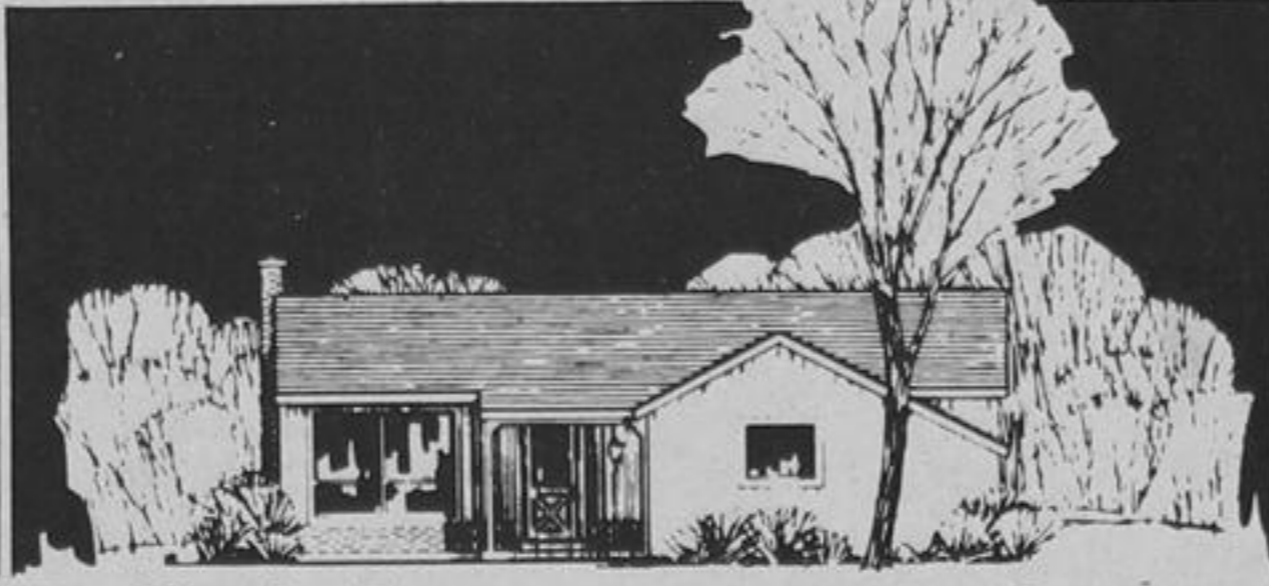
Dufferin I 1,182 sq. ft. Finished Floor Area $53,900