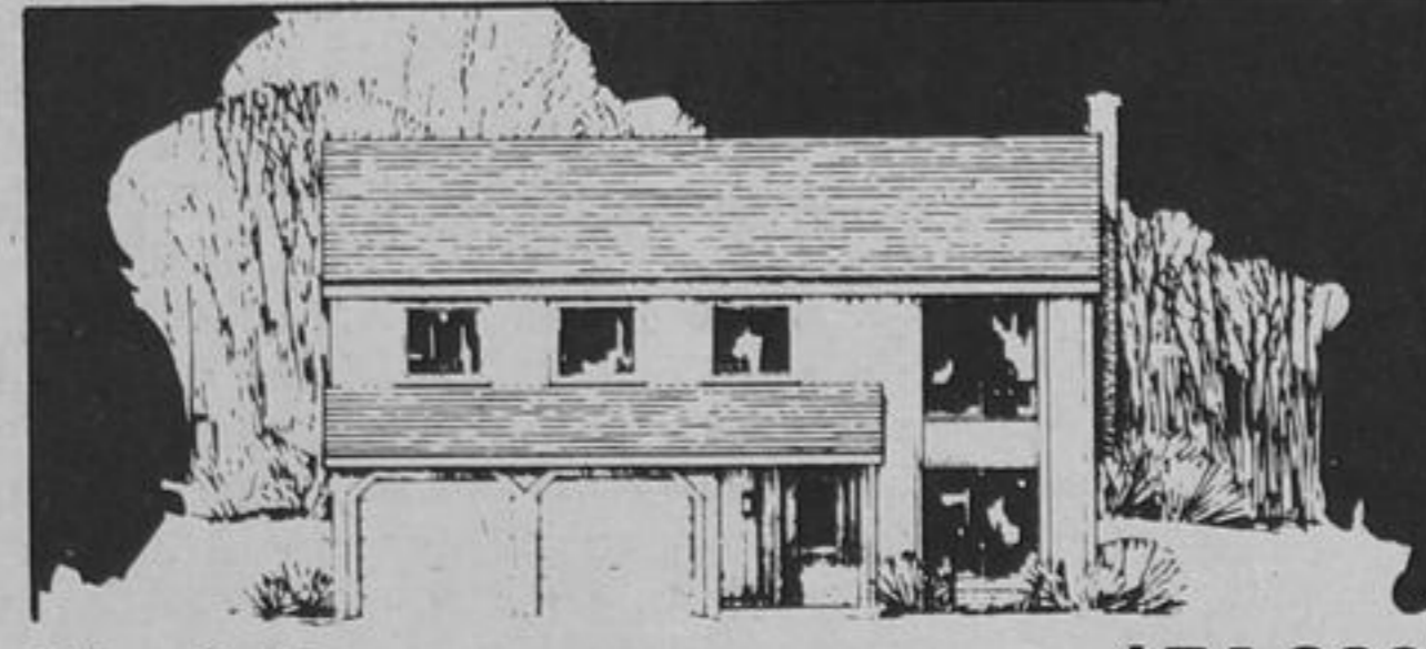
Norfolk 1,749 sq. ft. Finished Floor Area $54,900