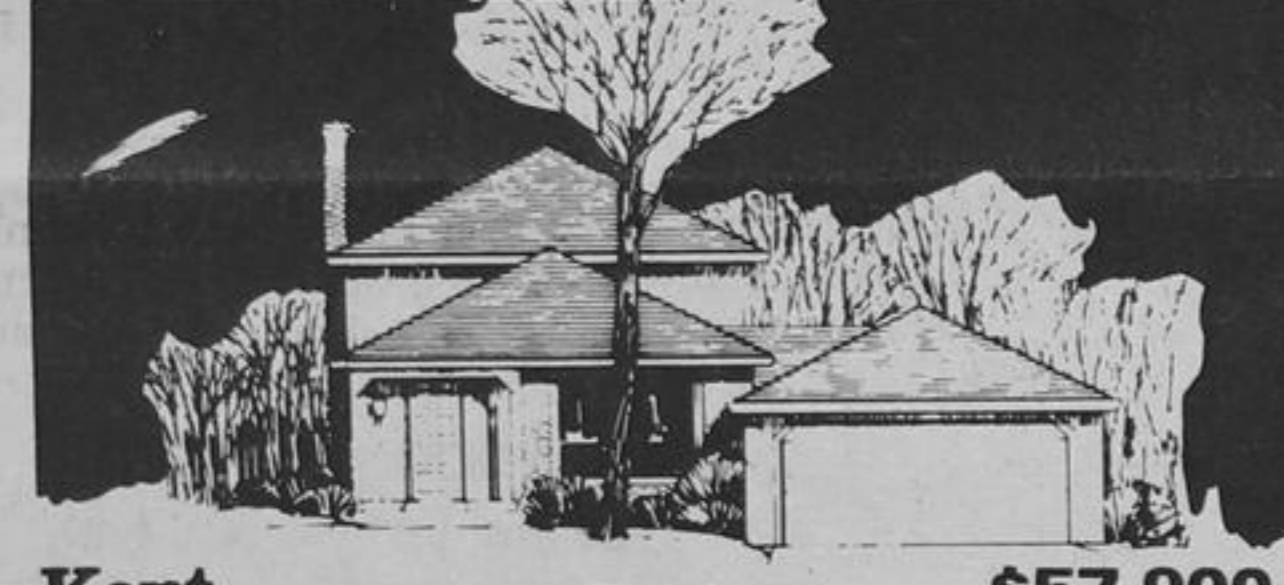
Kent 1,592 sq. ft. Finished Floor Area $57,900