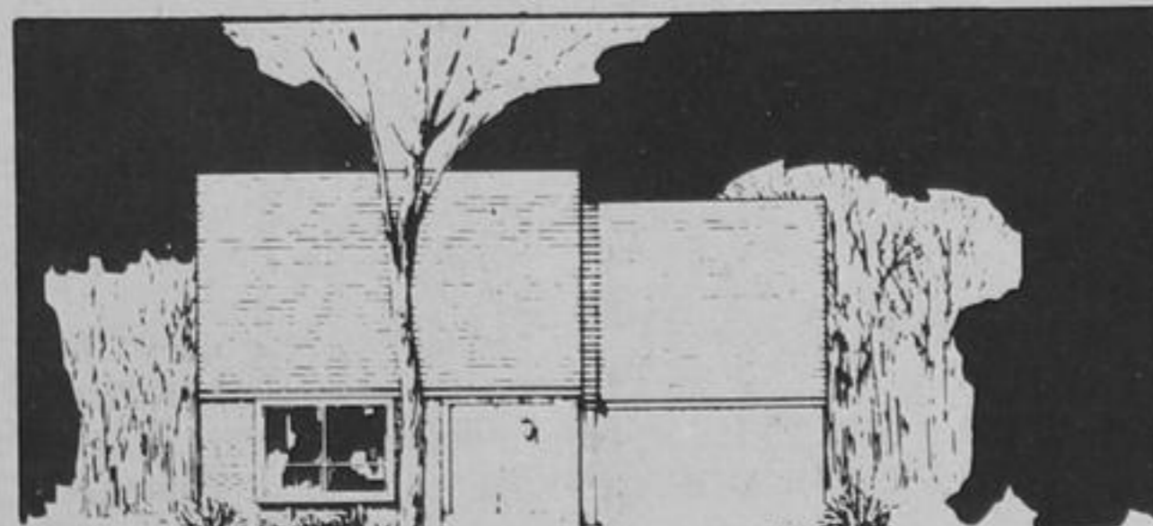
Glengarry 1,323 sq. ft. Finished Floor Area $49,900