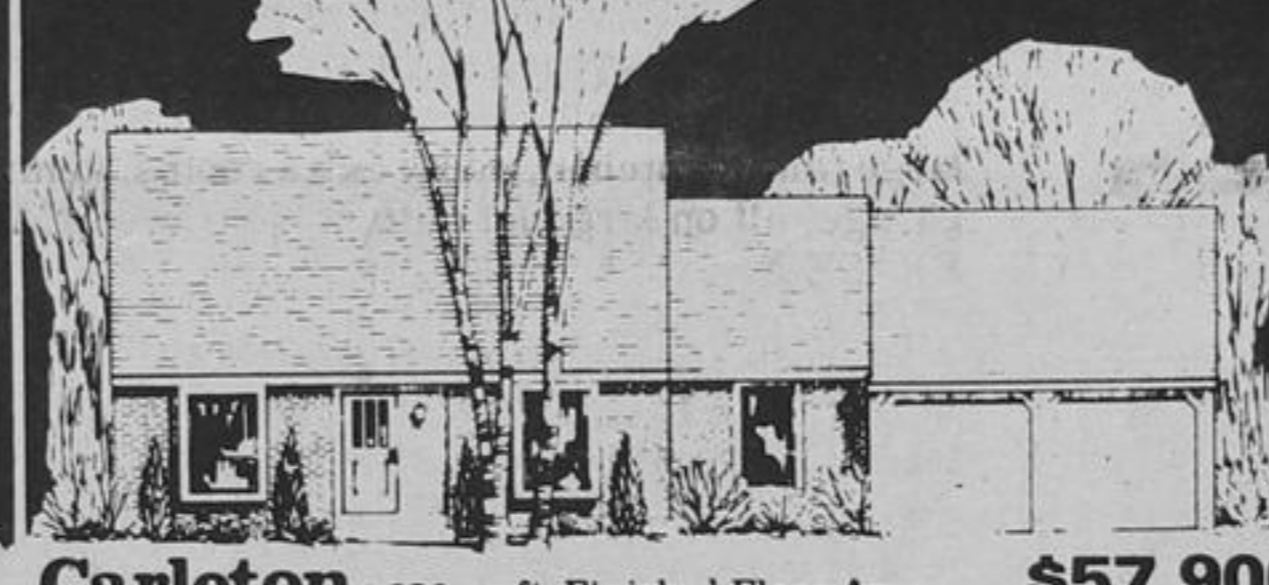
Carleton 1,828 sq. ft. Finished Floor Area $57,900