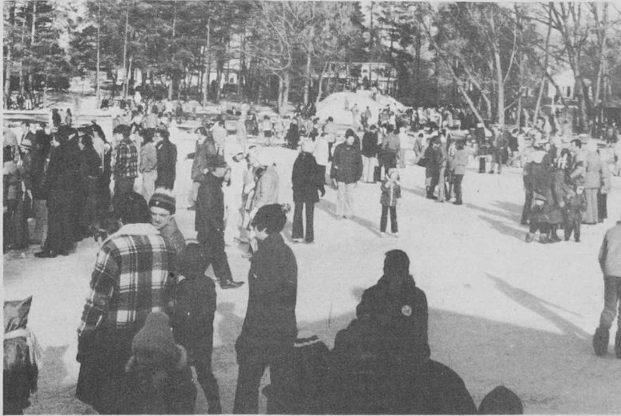
PART of large Saturday crowd at Mill Pond.