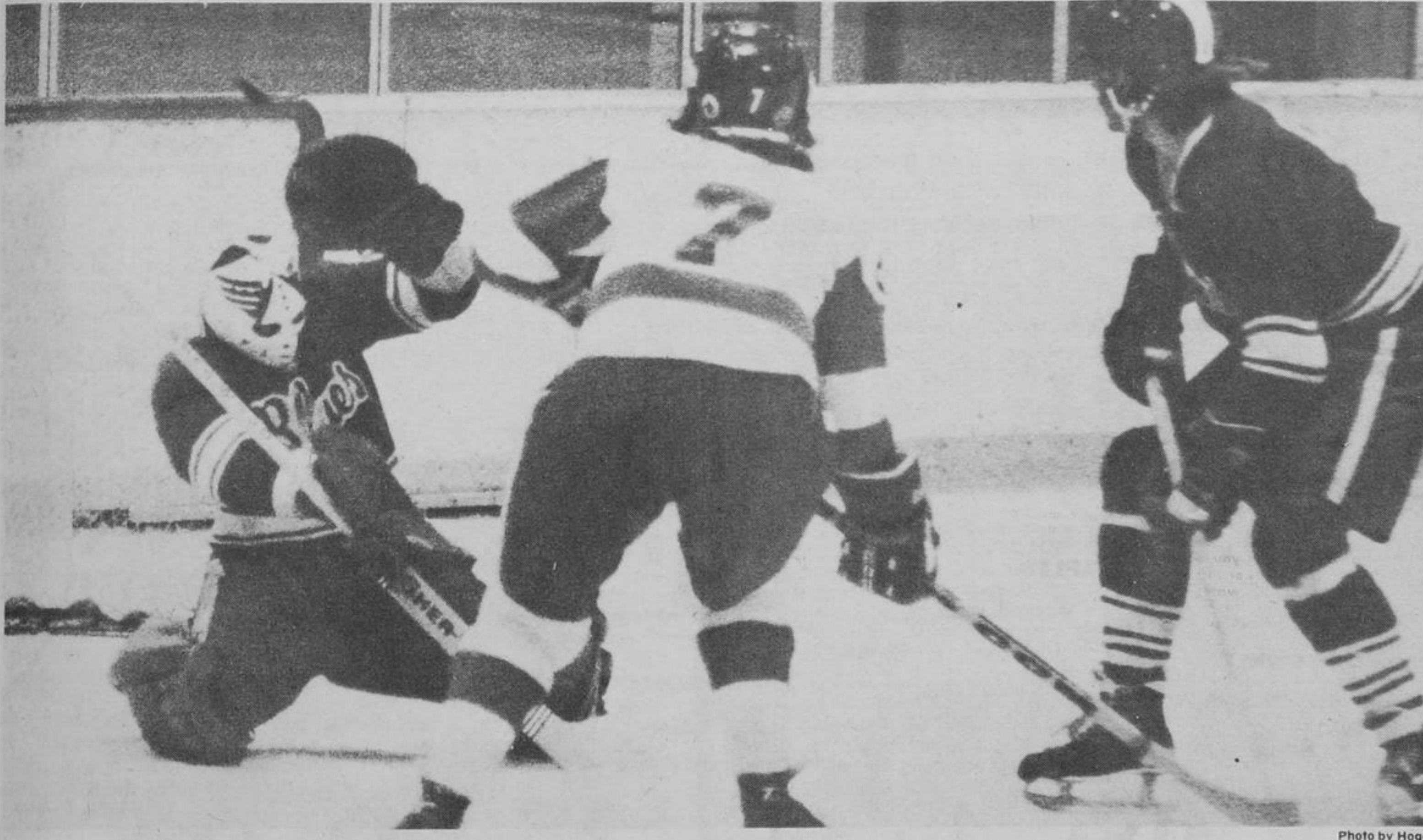
Thunderbirds on the attack