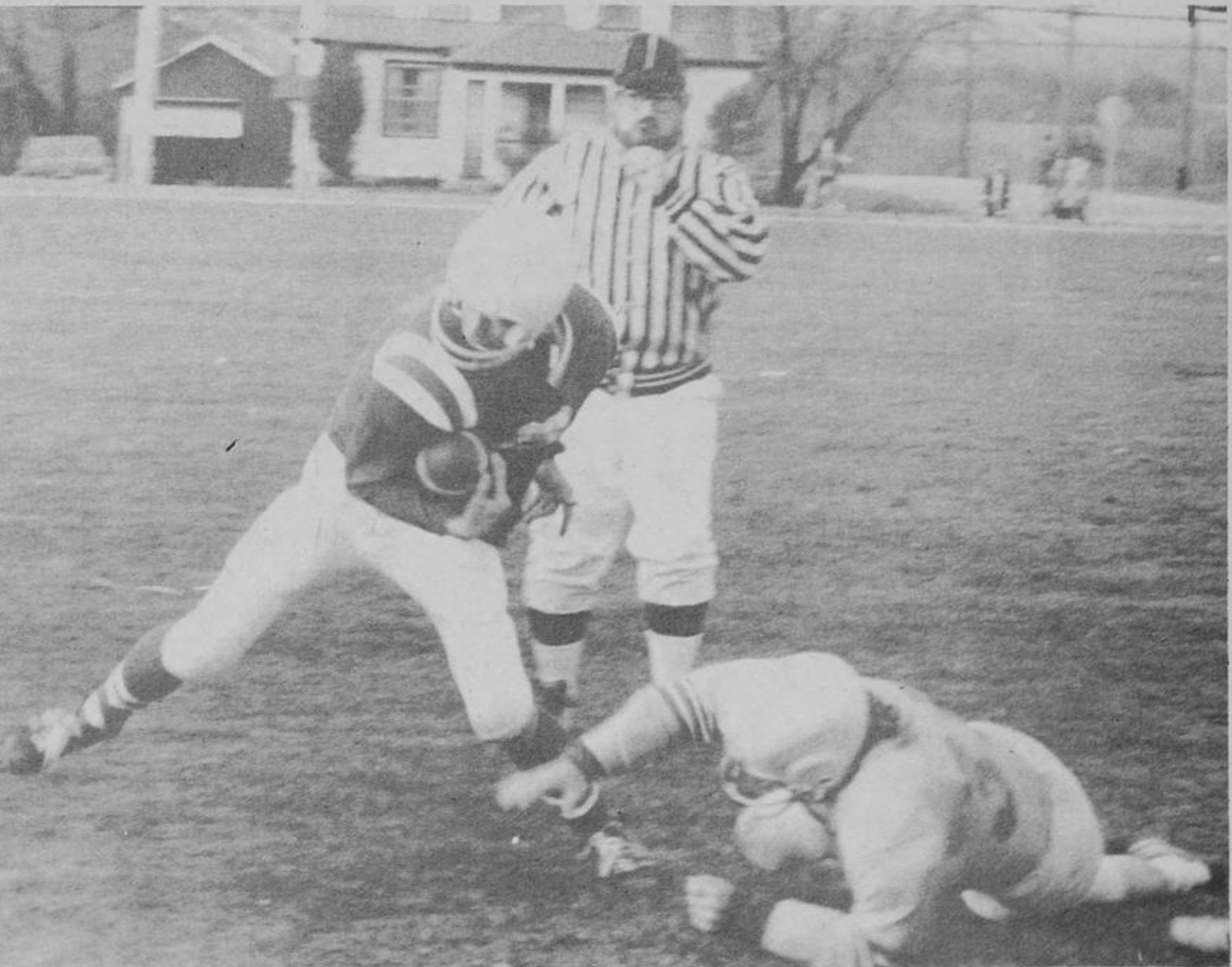
This is the one that got away!

The fallen King City footballer on the right tells the story as Markham High ball carrier