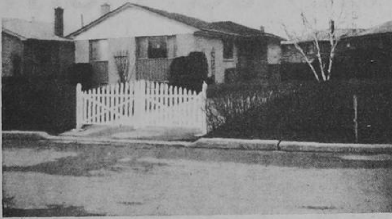
DETACHED BUNGALOW $61,900

Good value for this attractive brick home on 60.5 by 100 ft. lot, beautifully landscaped and maintained. House feature eat-in kitchen, three bedrooms and finished recreation room. Good location — very quiet yet close to all conveniences. $10 - $15,000 down. Call Jane Holmes 884-8183 or (res.) 884-5238.