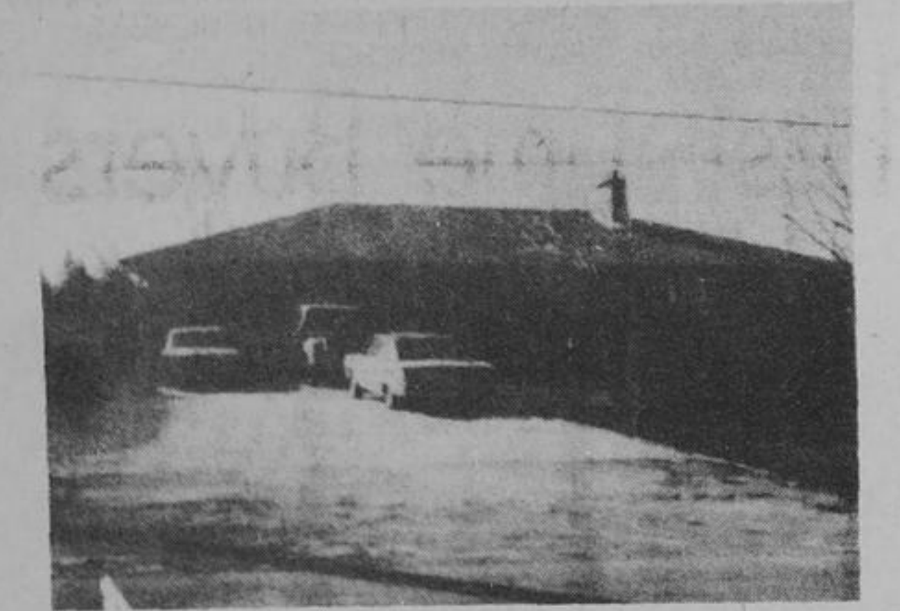
RICHMOND HILL — $30,000 DOWN

This solid brick bungalow in the Richmond Hill area with a family kitchen, 3 bedrooms, L-shaped living room-dining room combination, has a completely finished basement, a large lot, a 14 x 28 in-ground pool and cedar deck. Just listed at $64,900. Joe Snidero 884-8183.