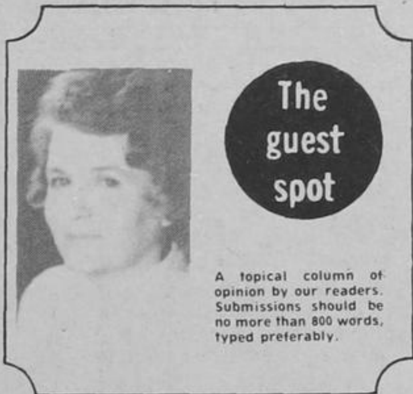
The guest spot A topical column of opinion by our readers. Submissions should be no more than 800 words, typed preferably.

A tendency towards change is beginning to emerge. The standing committee structure, given time, will ensure that trustees are at least well informed on one segment of the Board of Education business.