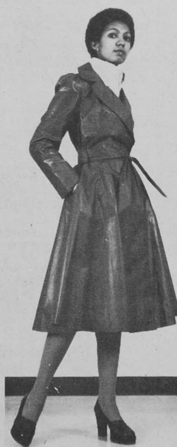
Althea's dusty-rose leather-look wrap around all-weather coat with self-sash belt of polyester and cotton blend has a paper feel and wears extremely well. Softly knotted scarf, high-collared shirt and narrow platform shoes set off the longer-look for 1975 from Sears.

Men's fashions And for men there are the casual safari outfits, the natty blazers to be worn with vests and dark trousers for more formal occasions.