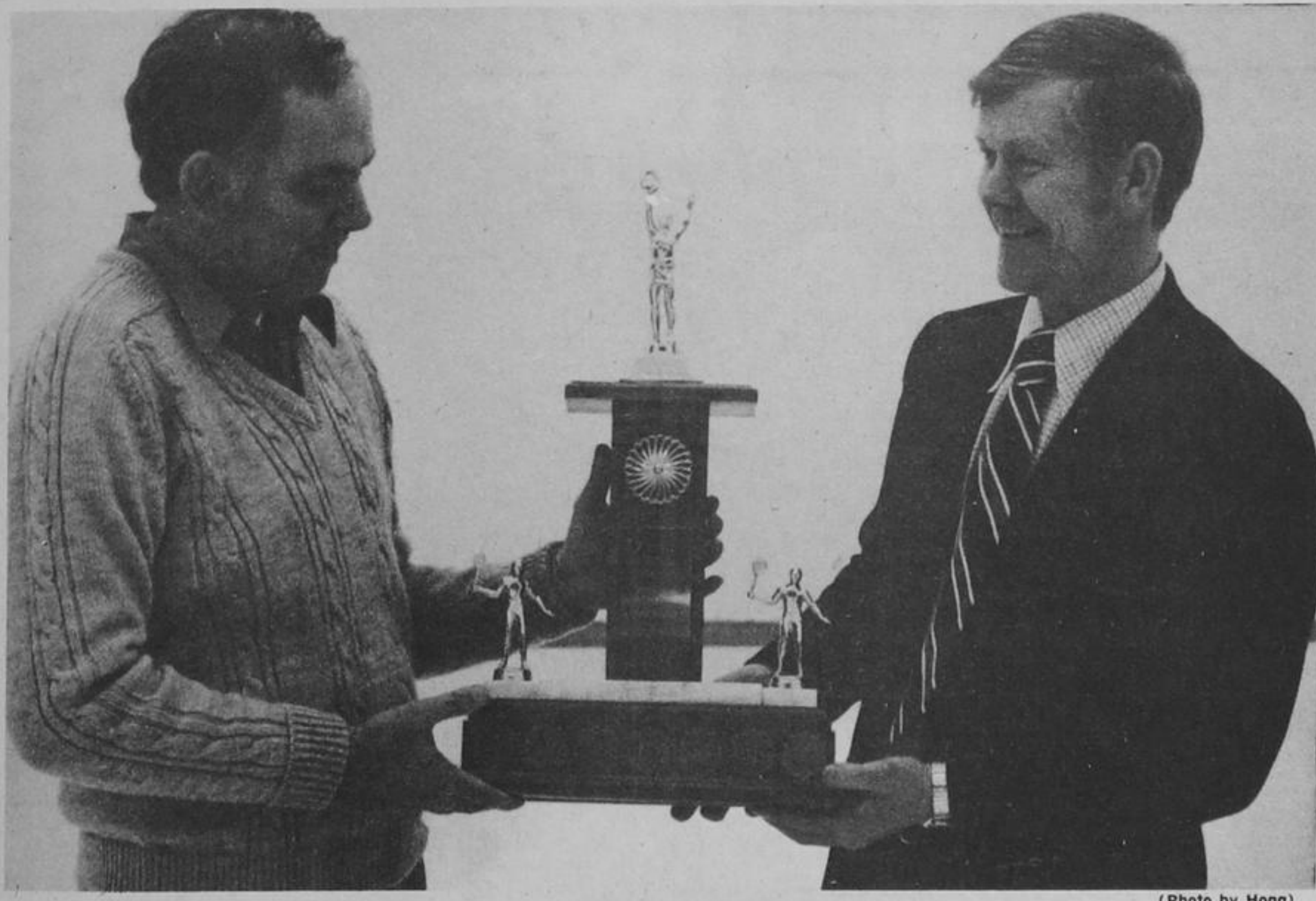
Big Squash winner here