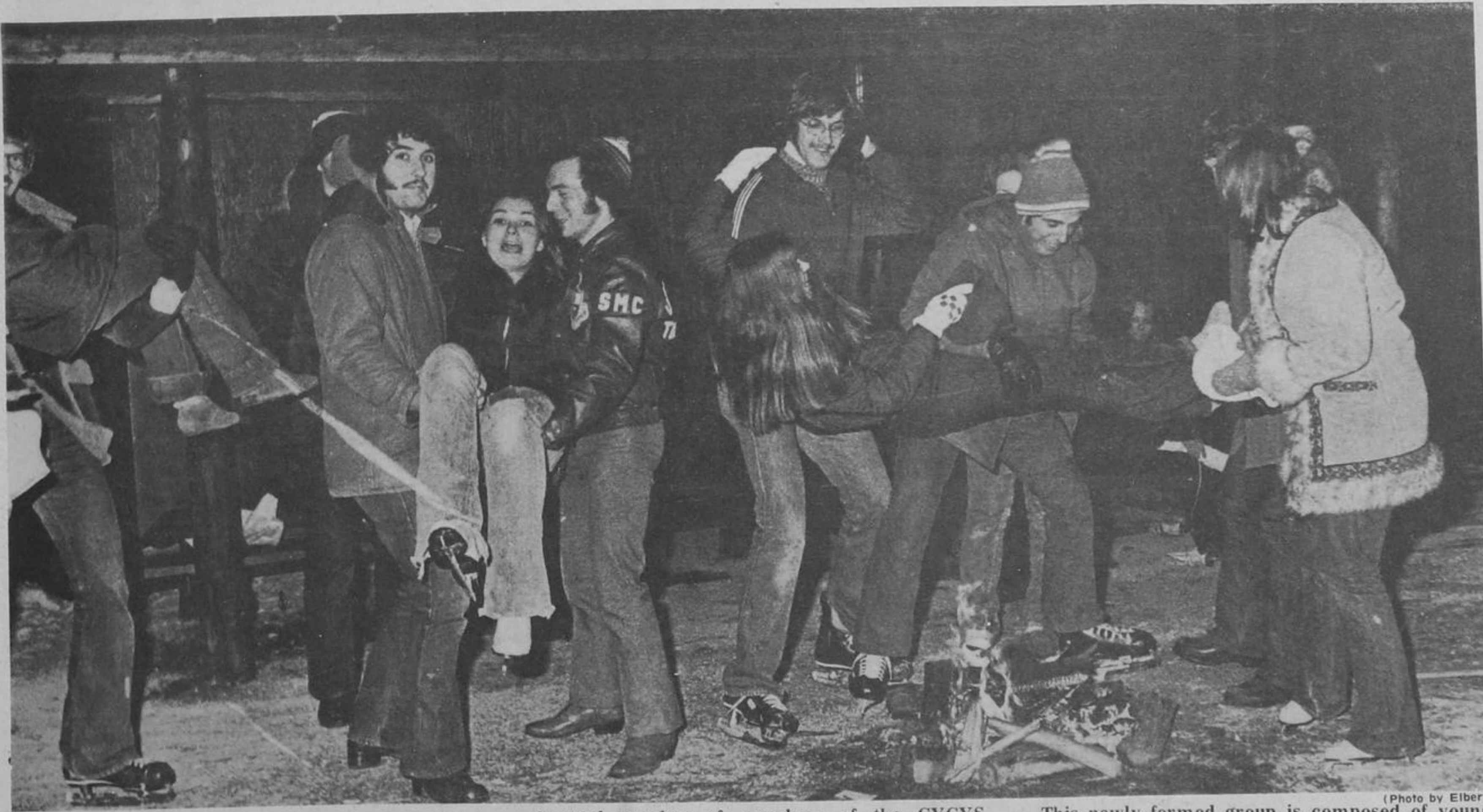
York South Catholic Youth skating party

A good number of members of the CYCYS (Catholic Youth Club York South) participated in the recent skating party at the Thornhill Pond (Highway 7B). The weather was frosty and the young people enjoyed the warmth of a small fire in between skates — and the boys didn't really roast the girls. Following the skating they went to St. Luke's Church on Green Lane for a warm-up party and coffee.